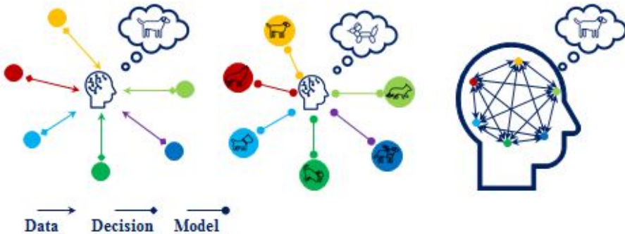
Figure 7.2 Comparing the conventional AI solutions based on centralized AI (left) and FL (middle) to EI (right).

The concept of EI was first proposed in the late 1980s as a biological term, which describes the intelligence of animals originating spontaneously and emergently from many simple units that are interconnected and interacting with each other in a complex manner [3]. Thereafter, this phenomenon was rapidly noticed in the engineering field and has inspired to develop bionic intelligent approaches. The most typical and significant instance of artificial EI is the family of approaches known as particle swarm optimization [2]. Distinguished from classical AI approaches that require the task-specific global knowledge to be explicitly integrated into a problem solver, EI approaches exploit the numerous agents involved in the task to opportunistically operate upon their representation-specific local knowledge, whereas the task-specific knowledge can be separated from the distributed problem solver, i.e., the agents. A comparison is briefly illustrated in Figure 7.2. In the framework of classical centralized ML, data are aggregated from users to a central node, where a task-specific global model is trained and shared by all users.