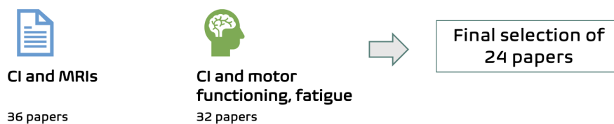
Figure 2: Works selection.

We looked at papers published between 2000 and 2021 that evaluate the cognitive impairment of at least one cognitive domain via a NP test (administered either via a traditional paper-and-pencil approach or a computerized approach), and that look for correlations between cognitive measures and other clinical evidences. We selected 36 papers that explore the relationship between CI and MR images characteristics, and 32 papers that explore the CI in connection with motor functioning, fatigue and depression, as shown in Figure 2.