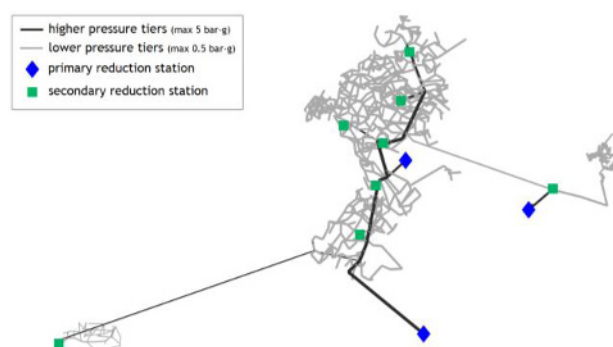
Fig. 1. Distorted representation of the topology of the distribution gas network infrastructure.

consists of two highly meshed infrastructures: the main one serving the main urban area and a much smaller one that serves a satellite urban conglomerate. The lower pressure network of the urban area is fed by six pressure regulators which are connected to the main higher pressure backbone plus one pressure regulator delivering the gas from the higher pressure duct connected to the third city booth. The lower pressure network of the satellite urban conglomerate is fed by a single pressure regulation station connected to the main higher pressure backbone by means of a branch pipe. The total number of pressure regulators in the distribution network is eight. In Figure 1 a distorted version of the network structure is given.