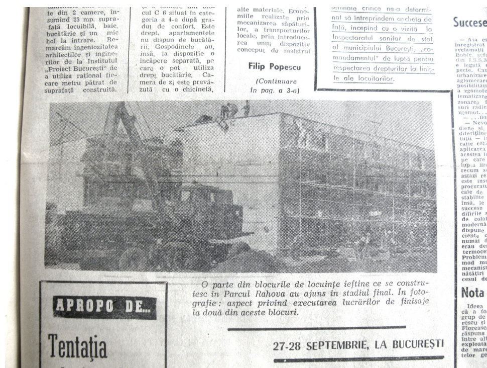
Figure 3: The first “nefamiliști” bloc, piloted in Rahova, near Ferentari (from the Comitetului Municipal București al PCR periodical, Informația Bucureștilui , 13 September 1968; source: Arhivele Naționale Istorice Centrale—ANIC, Bucharest)