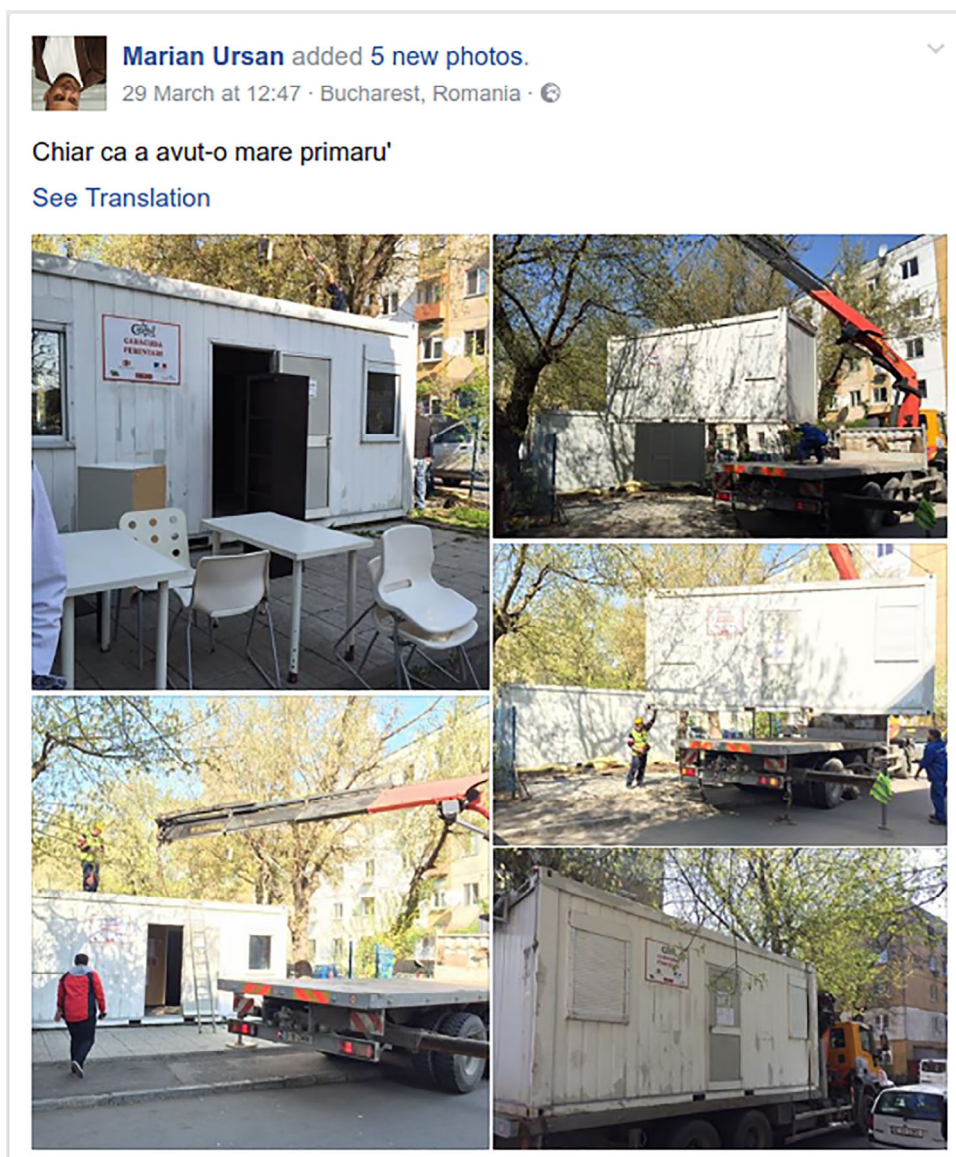
Figure 5: Dispossession of Caracuda—the only harm reduction centre in Ferentari