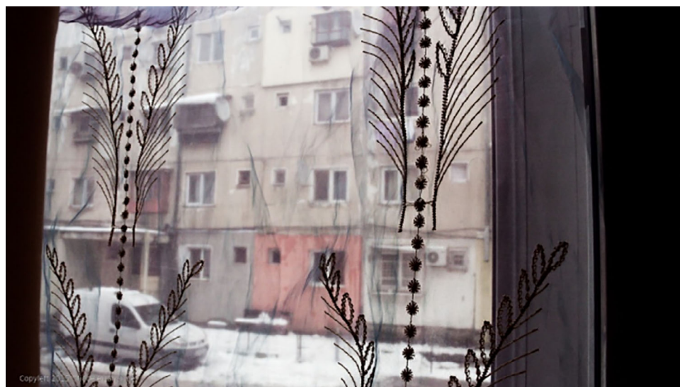
Figure 4: One of the blocs of Livezilor seen from Adrian’s room

It is through these stories, without a declared sense of direction but which allow for a circulation to happen, that a “route” is opened and an urban futurity, at first implicitly and then explicitly, is planned for. This is a plan where the flow is constantly interrupted—by withdrawal, lack of support, jail, precarity, and also collective shame and media denunciation of the “ghettos” of Bucharest in 21 st century Europe—and yet, through those interruptions, its foundational dispossession is allowed to continue.