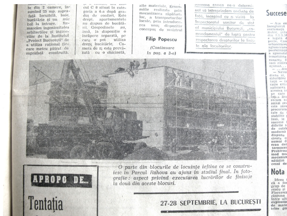
Figure 3: The first “nefamiliști” bloc, piloted in Rahova, near Ferentari (from the Comitetului Municipal București al PCR periodical, Informația Bucureștilui , 13 September 1968)

The problem was of course bigger than Ferentari itself. As I have illustrated in another paper (Lancione 2018), the communist state did not have a clear policy on “gypsies” for many years (Merfea 1994). The approach taken by the authorities was to consider Roma “workers” like any others, including them in the working classes, even though they mostly undertook lower-skilled jobs. While this might initially appear inclusive, it actually both stemmed from and contributed to the inability and unwillingness of the authorities to tackle the “ethnic” question, which remained high during those years (Gábor et al. 2009). While the state improved living conditions for many Roma, the perception of them as an inferior social group remained unchallenged, having become ingrained thanks to the long history of violence, tracing back to their enslavement in the country. In this context, as Veda Popovici recalls, in Romania the “failure of socialism to address racialization laid the ground for capitalism’s blunt exploitation of racialized histories” (in Florea et al. 2020:152).