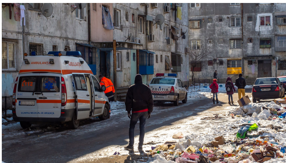
Figure 1: Lifelines in Aleea Livezilor, 2015

In this paper, I aim to expand on contemporary Western race-aware urban scholarship, providing a situated ethnographic and archival reading of dispossession in the Romanian post-socialist context—one that has the potential to enhance trans-Atlantic critical race grammars. At the core of this work is the question of how