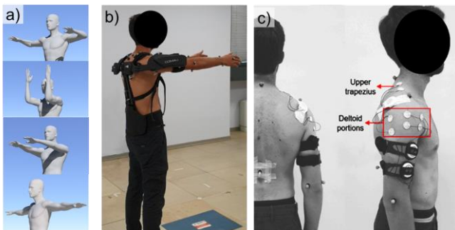
Fig. 2. (a) shows the four static postures considered in the study. (b) shows one subject wearing the MATE exoskeleton in posture P3. (c) shows the positioning of EMG electrodes.

Bipolar EMGs were collected from the anterior, medial and posterior deltoids and the upper trapezius of the right upper limb using pairs of surface electrodes (30 mm inter-electrode distance, 24 mm diameter, Spes Medica, Battipaglia, Italy) and digitized at 2048 Hz with a 16 bits A/D converter (DuePro, OTBioelettronica and LISiN, Politecnico di Torino, Turin, Italy). Kinematic of upper limbs were recorded simultaneously with EMGs by a 12 camera VICON system (100 Hz, Vero v2.2, Oxford, UK), positioning the markers according to the protocol proposed by Hebert et al. (2014) [3].