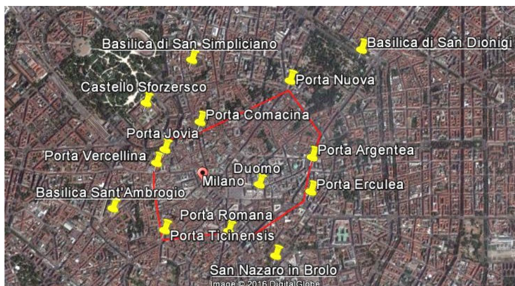
Figure 1: Mediolanum, the Roman Milano, in an image of Google Earth with the perimeter marked in red. The Roman Milano had several gates (porte). Outside the town, Ambrose planned to build four basilicas (San Dionigi, San Nazaro in Brolo, Sant' Ambrogio e San Sempliciano), as four guards of the faith in Mediolanum and in the surrounding territory.

As discussed in [4], the early Christian basilicas of Milano can be divided into several categories, according to their building periods. The first basilicas were composed by two separate churches, one for the baptized people, the other for catechumens. This particular conformation could have been modelled on the "horrea", a public warehouse used during the Roman period. A later stage corresponds to that of the great cathedrals of the late Roman Empire [4], formed by a polygonal shape, the layout of which was the model for the very large basilicas such as those in Constantinople. The area that is corresponding to Piazza Duomo had two cathedrals, the "basilica vetus", used during the winter season, and the "basilica nova", used during the summer [5].