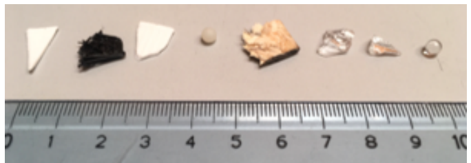
Fig. 2. A picture of the contaminants used for testing, and a ruler as a dimensions reference.

The MW sensing system is shown in Fig. 1; an arch-shaped 3-D printed support is holding the antennas in a fixed position around the target. Their number and position have been evaluated considering the degrees of freedom theory [6]