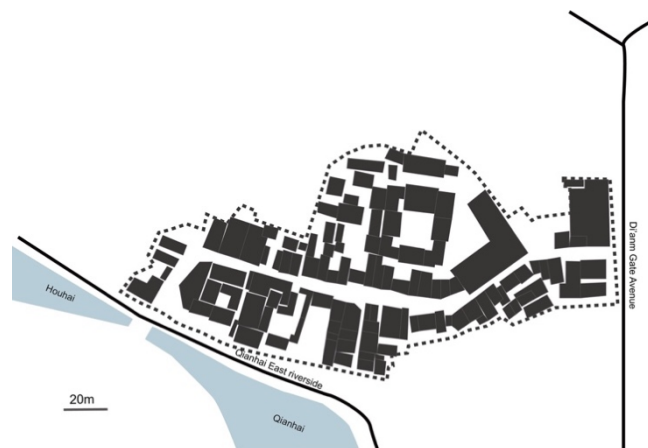
Figure 3. The morphological map

basis of courtyards and expanded in disorder in order to increase the living area. The courtyard space has also been transformed into living space due to the high population density, completely destroying the original type of the courtyard. Therefore, in the restoration process, the buildings with the characteristics of courtyard houses are "combed" and "integrated". The specific method is to demolish illegal parts of buildings and restore the original courtyard space function, so that the building typology becomes the original form in terms of space. The overall form of Yandai historical street gradually restored to the original pattern of Ming and Qing Dynasties-courtyard building and Hutong Street (Figure 3).