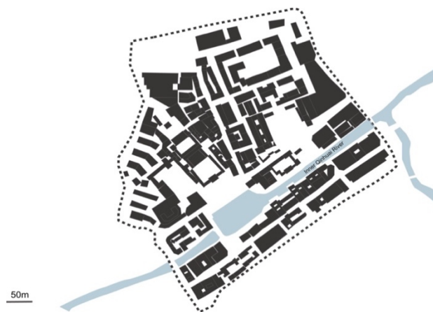
Figure 5. The morphological map