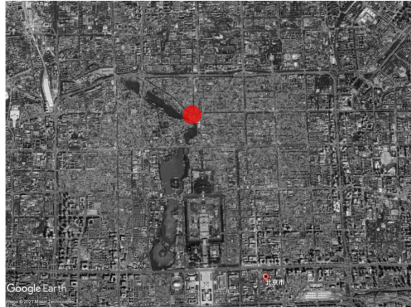
Figure 2. The Location of Yandai historical street

basis of courtyards and expanded in disorder in order to increase the living area. The courtyard space has also been transformed into living space due to the high population density, completely destroying the original type of the courtyard. Therefore, in the restoration process, the buildings with the characteristics of courtyard houses are "combed" and "integrated". The specific method is to demolish illegal parts of buildings and restore the original courtyard space function, so that the building typology becomes the original form in terms of space. The overall form of Yandai historical street gradually restored to the original pattern of Ming and Qing Dynasties-courtyard building and Hutong Street (Figure 3).