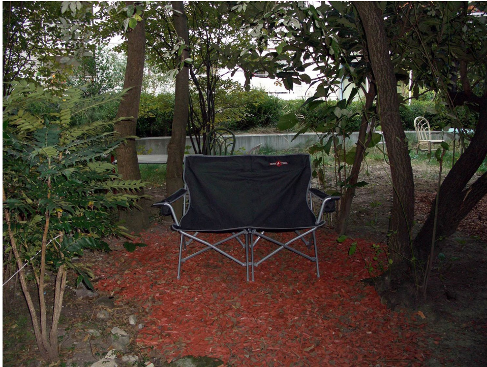
Fig. 2 Domestic use of public space in Les Grottes.

one's neighbours; the right to intimité , privacy, intimacy, non-interference; the right to be left in peace; the right to extimité , 8 extimacy, i.e., to intimate relations within a public space; the right to slow mobility, to play in the street, to take care of public space with flowerbeds full of lavender and chamomile; the right to raise hens in the city centre; the right to craftsmanship. And more besides: the right to live in a neighbourhood not modelled by the market and renewal policies; the right to radical environmental awareness; the right to enjoy a suburban vernacular landscape in the heart of one of the richest cities in Europe where land is literally worth gold. A mess, or rather, a sort of bundle of rights (Hohfeld 2013; Marcuse 1994) that not only highlights its variety, but draws attention to the changing forms of appropriation of space. Enhancement, unavailability, and subtraction all involve relationships capable of building “things” (houses, space) as objects of right. There is no mention of private property in this superimposed set of elements (Fig. 2).