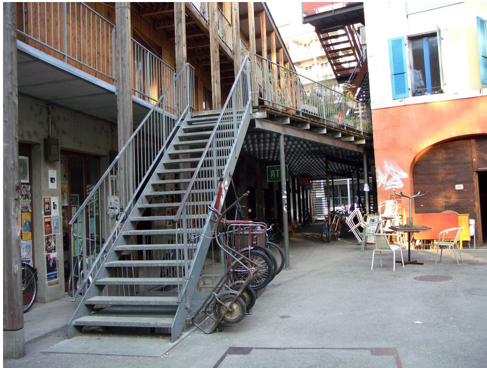
Fig. 1 Public space, Les Grottes.