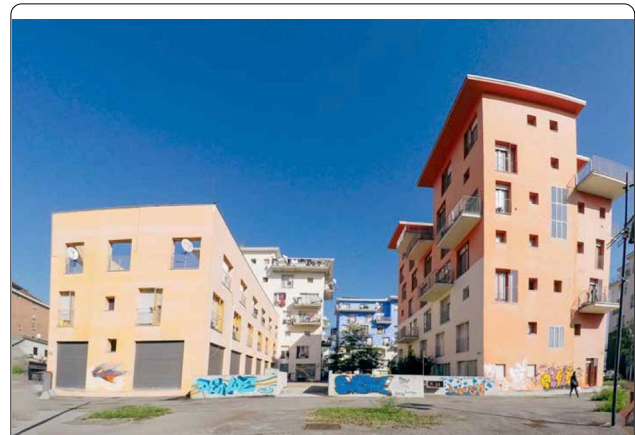
Fig. 3 The transformation of the Olympic Village