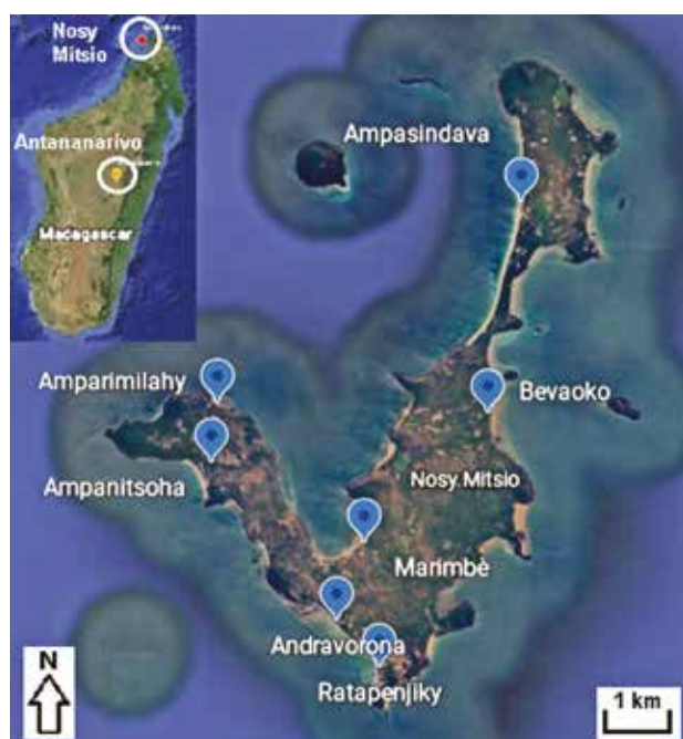
Fig. 1 – Nosy Mitsio Island.

The scarce availability of agricultural inputs, chemical fertilizers and improved varieties of seeds, along with the fact that only few farmers have ever received any technical training on crop production, make the entire community highly vulnerable. In Madagascar, small farms are exposed to a number of risks such as pests, disease outbreaks and extreme weather events, which undermines the owners' food and income security (Morton, 2007). Nosy Mitsio is no exception and local farmers face food insecurity and are vulnerable to external shocks.