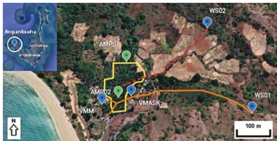
Fig. 3 – Ampanitsoha village: existing water supply pipe (continuous line) and projected system (dashed line).

The results of dry and wet sieves are different. If the soil is dry, it can be classified as a sandy soil with a fine material fraction lower than 10%. On the contrary, if the soil is wet, the fine fraction, com-