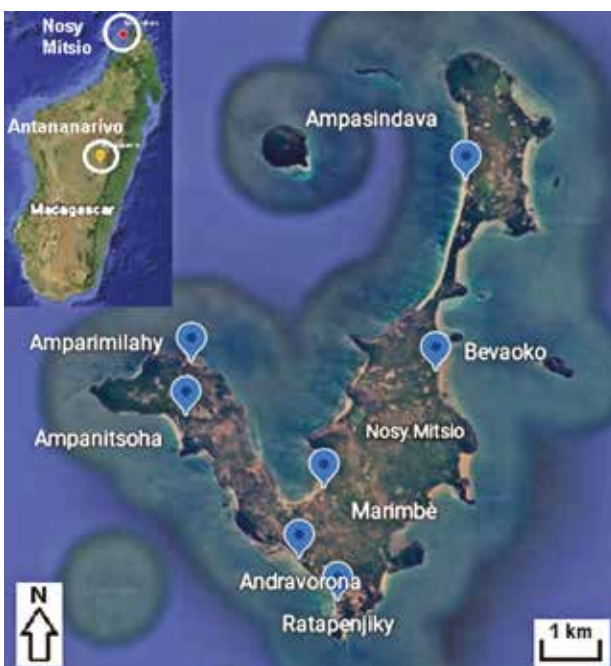
Fig. 1 – Nosy Mitsio Island.

The scarce availability of agricultural inputs, chemical fertilizers and improved varieties of seeds, along with the fact that only few farmers have ever received any technical training on crop production, make the entire community highly vulnerable. In Madagascar, small farms are exposed to a number of risks such as pests, disease outbreaks and extreme weather events, which undermines the owners' food and income security (Morton, 2007). Nosy Mitsio is no exception and local farmers face food insecurity and are vulnerable to external shocks.