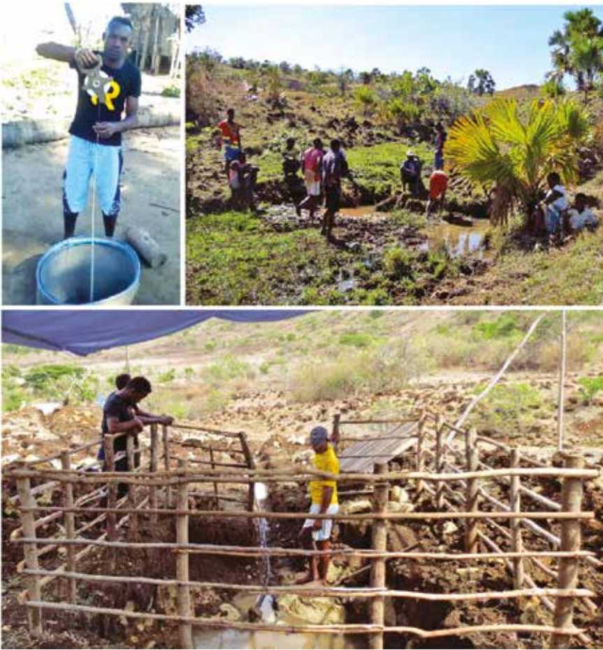
Fig. 4 – Photos taken on Nosy Mitsio island. From top left: a local man measures the well depth; the source WSOI at its natural state; locals engaged in the construction of the water catchment at source WSOI.

stern staff and local inhabitants and thanks to the in-depth knowledge of local dynamics.