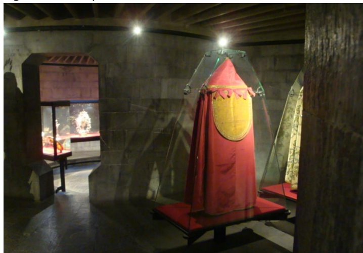
Fig. 3 interior space

The irregular geometric space and the curved walls of the thòloi, as well as the lack of external references, immediately generate a loss of orientation in the visitor, immersing him or her even further into an "other" place with no apparent connection to the world above. At the same time, this place has been described as a total environment, as an interiority without comparison.