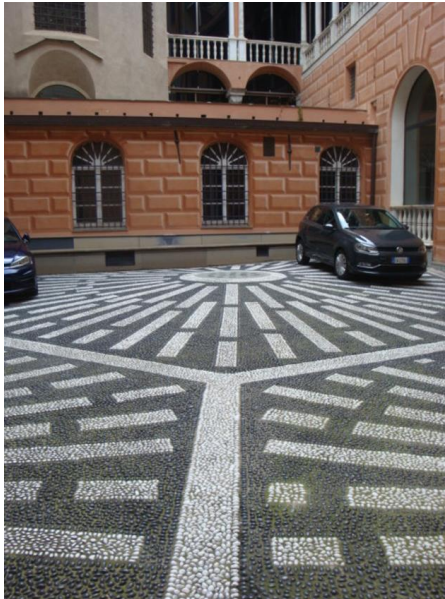
Fig. 1 the courtyard paving reveals the underground museum by reproducing the geometric lines of its structure

This small museum arose to house the collection which had until the Second World War been on public view in a room behind the sacristy. In 1865, the question of the proper conservation and display of the treasury was raised, but it was not until 1900 that the Museum of the Cathedral Treasury was legally established and three cabinets with iron doors were built and placed in the sacristy. However, this arrangement, which remained in place for fifty years, made it too easy to handle and move the objects, which not only deteriorated but also, over time, ended up being arranged in no particular order.