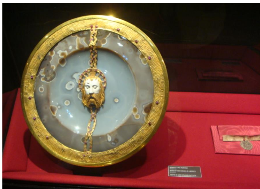
Fig. 7 The St John the Baptist's plate

In addition to the relics, the museum also houses objects of great devotional value. In the third thòlos is the famous St John the Baptist's plate, made of chalcedony, gold and precious stones. According to tradition, it was used to hold the head of the Baptist after his beheading. It is Roman, from the first century CE, probably commissioned by an emperor, with a later intervention by a goldsmith from Paris who in the early 15th century added an elegant decorated frame (which actually keeps the parts together as the plate is broken) and inserted a small head of the Saint in the centre. The decoration was probably commissioned by King Charles VI himself, or at least by a member of the Valois dynasty, and later a councillor of the king gave it to Pope Innocent VIII who, on his deathbed, gave the precious dish to the Protectorate of the Chapel of St John the Baptist. In addition to its artistic value, it also has an exceptional devotional value, emphasized by a special feature: chalcedony is a material worked with diamond dust, and changes colour with the light. The