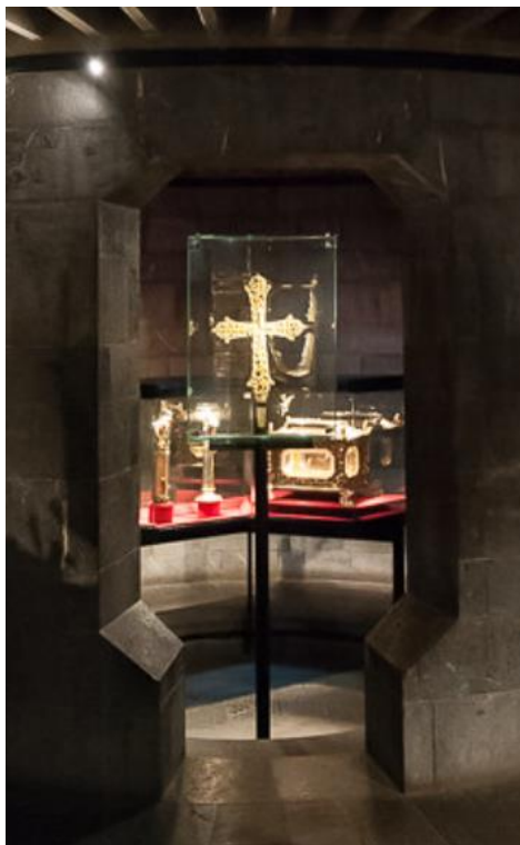
Fig.- 6 the Zaccaria Cross

Indeed, in the second thòlos stands out the Byzantine “Cross of Zaccaria”, from the 13th century, made of gilded silver and decorated with pearls and precious stones, which is also a reliquary, as it holds fragments of wood that tradition says came from the Cross of Christ. It was commissioned by the Emperor of the East in the 9th century to give to the Basilica of St John the Evangelist in Ephesus. In the 13th century, the Bishop of Ephesus had it restored as it was in a very poor state of preservation, as evidenced by an inscription in Greek on the back. In 1308 the Turks plundered the basilica, but the cross was immediately recaptured by the Genoese Zaccaria family (from whence it takes its name), who then donated it to Genova Cathedral. It was later used in the consecration ceremony of the Doge on the day of his election, and it is still used today to welcome the new Archbishop entering the Cathedral, as well as being displayed in the Cathedral every year on Good Friday.