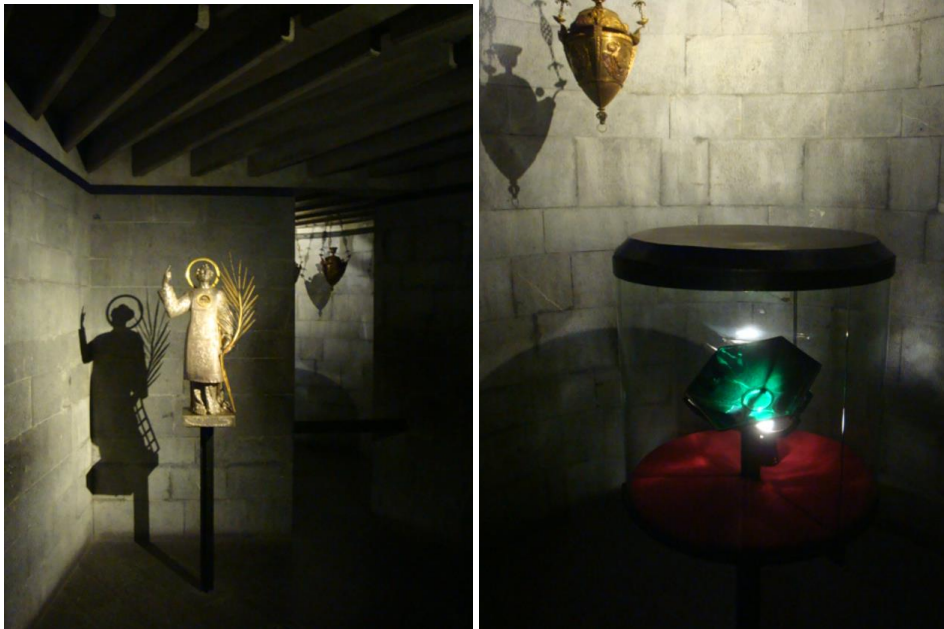
Fig. 5 the so-called "sacred bowl" (considered the Holy Grail)

delicate restoration operation. It is not clear whether it is of Roman (1st-5th centuries CE) or Arab (9th-10th centuries CE) origin, but it is part of the spoils of war brought to Genova in 1101 during the First Crusade. In the 13th century, the Archbishop of Genova identified it as the Holy Grail, and with the centuries its importance and its mystery increased, also because only eminent people could observe it closely. The precious object was even pledged by the Genoese government, which was in financial difficulty, and was