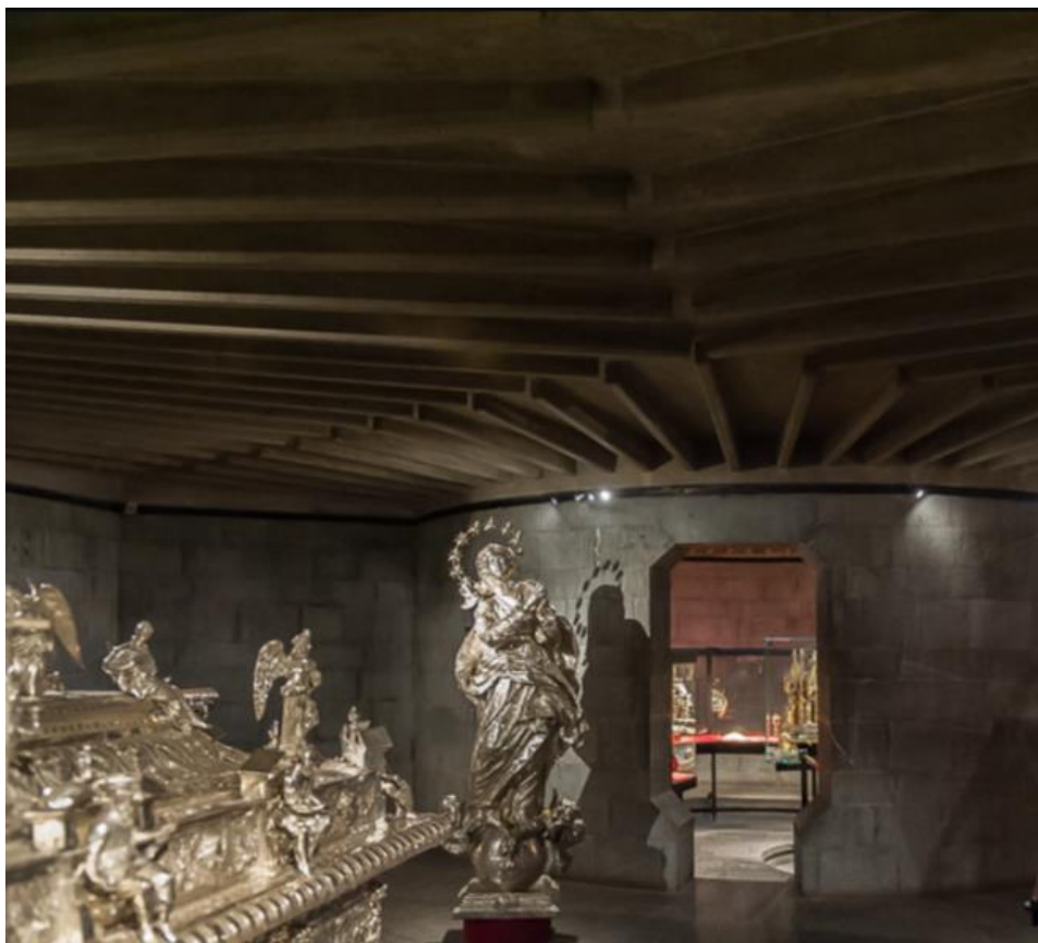
Fig. 8 the Corpus Domini ark and the Immaculate Madonna by Francesco Maria Schiaffino

Another important object from a historical and devotional point of view is the large, embossed silver statue of the Immaculate Madonna by Francesco Maria Schiaffino, which stands next to the opening leading to the second thòlos. The statue depicts the Madonna crushing the serpent wrapped around a globe and a half moon. The dramatic shadow produced by the statue, and its barycentric position, have made it somewhat of a symbol of the museum. Dated to 1748, the statue was donated to the Doge (his family crest is on the base), in memory of the liberation of Genova from the Austrian troops, and in turn the Doge offered it to the San Lorenzo Cathedral.