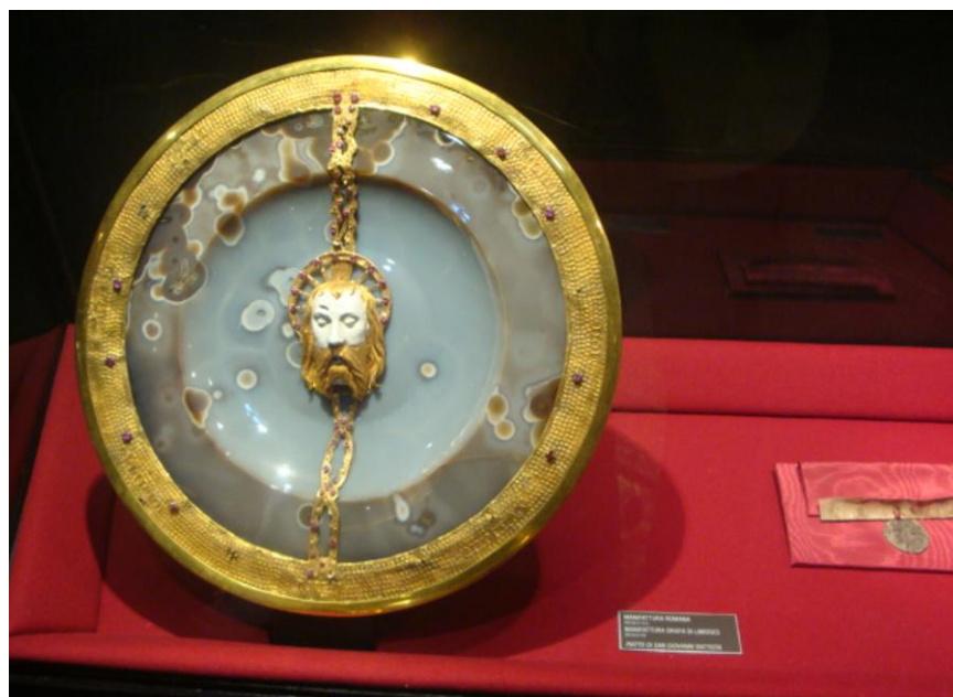
Fig. 7 The St John the Baptist's plate

In addition to the relics, the museum also houses objects of great devotional value. In the third thòlos is the famous St John the Baptist's plate, made of chalcedony, gold and precious stones. According to tradition, it was used to hold the head of the Baptist after his beheading. It is Roman, from the first century CE, probably commissioned by an emperor, with a later intervention by a goldsmith from Paris who in the early 15th century added an elegant decorated frame (which actually keeps the parts together as the plate is broken) and inserted a small head of the Saint in the centre. The decoration was probably commissioned by King Charles VI himself, or at least by a member of the Valois dynasty, and later a councillor of the king gave it to Pope Innocent VIII who, on his deathbed, gave the precious dish to the Protectorate of the Chapel of St John the Baptist. In addition to its artistic value, it also has an exceptional devotional value, emphasized by a special feature: chalcedony is a material worked with diamond dust, and changes colour with the light. The