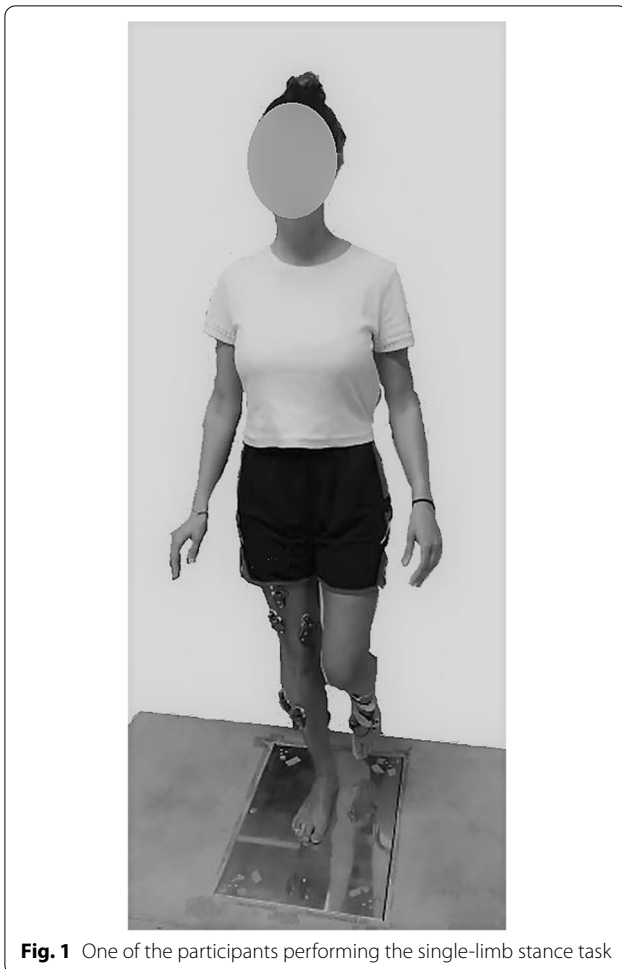
Fig. 1 One of the participants performing the single-limb stance task

Dorsii Omolateral to the dominant lower limb (LDO), and Longissimus Dorsii of Contralateral side (LDC) in accordance with SENIAM recommendations [33]. To reduce the skin impedance, before electrode application, the skin area was shaved and cleaned with ethyl alcohol. A footswitch (FSW) was placed under the first metatarsal head of the non-dominant foot. Force platform, EMG, and FSW signals were part of the same integrated system and were recorded with a 1000 Hz sampling rate.