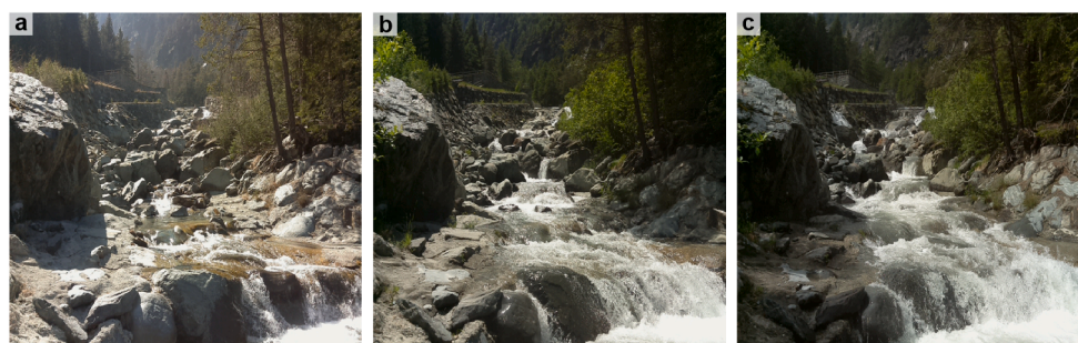
Fig. 2. Example of three images used by the landscape experts for the assessment of the Visual Elements Factor in case study 3. The images correspond to the following flow releases: (a) 100 l/s, (b) 740 l/s, (c) 1428 l/s.