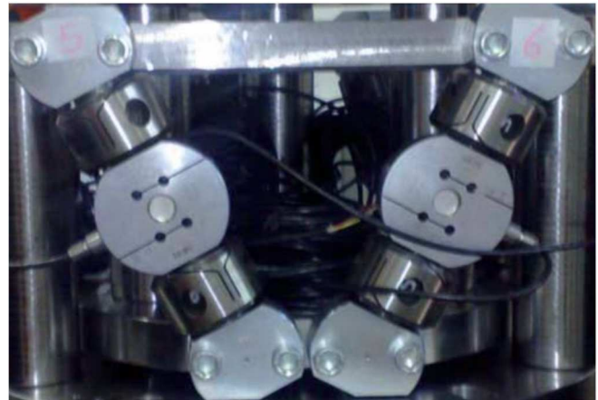
Figure 2. A pair of inclined UFTs with elastic hinges and clamping heads at both ends.

\alpha , \beta , \gamma and \delta angles are 55^\circ , 62.5^\circ , 60^\circ and 30^\circ respectively. The six UFTs have a capacity of 75 kN. These values entail a vertical force capacity of 400 kN, side force capacities of 100 kN, and moments capacity of 50 kN·m. Maximum deformations of the structure under the highest load are in the order of few millimeters. The six UFTs are connected to an external amplifier, which provides the required supply voltage to the transducers and acquires data.