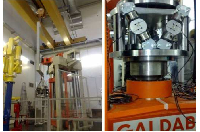
Figure 3. The HS MCFMT during the first calibration in the 1 MN deadweight FSM at INRiM.

the geometrical parameters described in Eq. (1) and by propagating them according to GUM [11], it is possible to get the overall uncertainties for the different forces and moments components. It is found that the uncertainties at maximum load for each component are 0.16 kN for transverse forces F_x and F_y , 0.43 kN for vertical force F_z , 0.07 kN·m for M_x , 0.10 kN·m for M_y , and 0.05 kN·m for M_z [4,12].