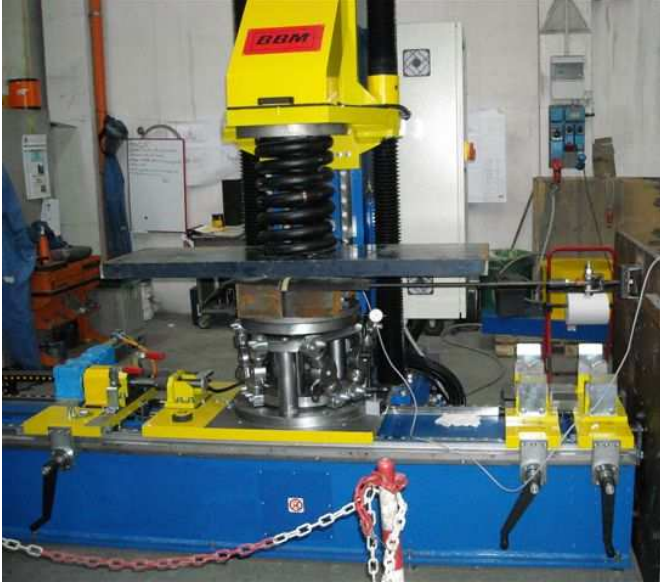
Figure 5. The second multicomponent spring testing machine by BBM during machine verification tests.

displacement and a lower movable bench aimed to detect the displacement along the transverse axis with a resolution of 0.01 mm. The HS MCFMT is placed upon the lower movable bench. Before starting the test, the springs are manually placed between the loading pad of the movable crossbar and the upper plate of the HS MCFMT, and centered by means of a caliper. The huge friction between the contact surfaces guarantees that no shifts nor slips occur. For the measurement of the side forces (and moments) generated by the spring under load, a hardened steel bar is used in order to fix the HS MCFMT and the lower bench to the base of the spring testing machine. The steel bar is then removed to measure the displacement along the transverse axis.