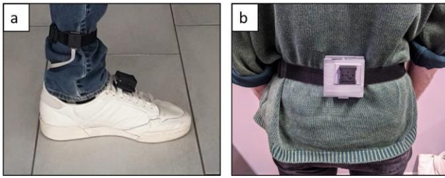
Figure 1: a) INDIP foot positioning (MIMU, PI, DS); b) INDIP lower back positioning.

instep using a clip. The DSs were attached asymmetrically, pointing medially, with elastic belts to the shanks to avoid mutual interference (Fig. 1). A total of 12 markers were used: four markers on each foot, and four markers placed on a rigid cluster used as support also for the lower back IMU. For the free-living acquisition, participants were equipped with the INDIP system only (Fig. 1).