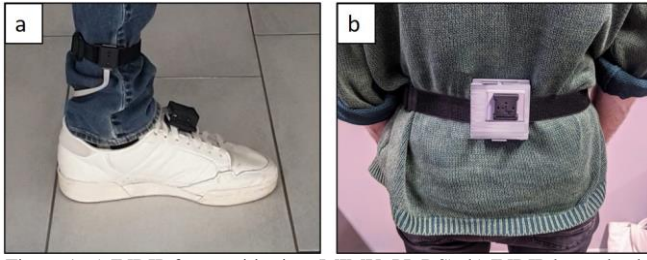
Figure 1: a) INDIP foot positioning (MIMU, PI, DS); b) INDIP lower back positioning.

instep using a clip. The DSs were attached asymmetrically, pointing medially, with elastic belts to the shanks to avoid mutual interference (Fig. 1). A total of 12 markers were used: four markers on each foot, and four markers placed on a rigid cluster used as support also for the lower back IMU. For the free-living acquisition, participants were equipped with the INDIP system only (Fig. 1).