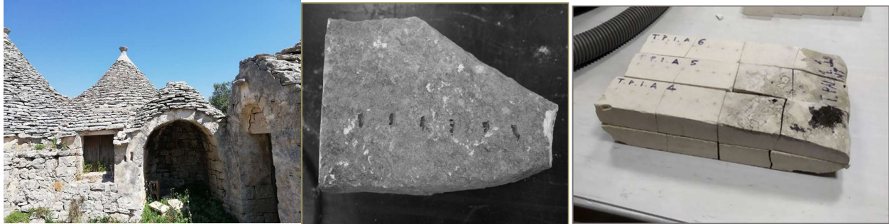
Figure 2 - The “Trullo” sampled (left) with one of the samples collected (center) and cut into specimen for the tests (right).....

The “Trullo” samples were collected from a rural construction of the first years of 1800 (fig. 2.). The samples show typical alterations characterized by brown colour and presence of lichen, typical for this kind of constructions.