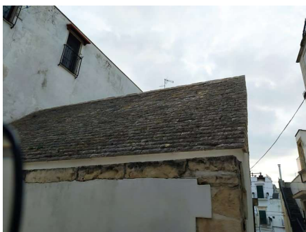
Fig. 4 Roof of a Itria Valley typical construction built with recent Chiancarella.

From the petrographic analysis the “Trullo” and the quarry sample can be classified as biomicrite according the Folk classification (R.L.Folk, 1962) . In Fig 5a the microphoto Alveolinidae and algae are well recognizable in thin section. In the microphoto of quarry sample (fig 5b) a fragment, probably a Bivalve, can be observed together with Foraminifera and algae rests.