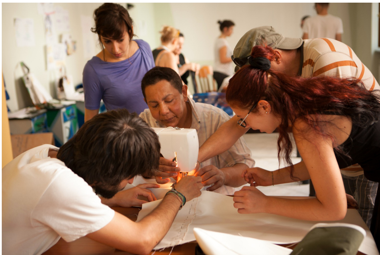
Figure 3. Sewing workshop: Citizens, both experiencing homelessness and otherwise, are sewing together during a “Costruire Bellezza” workshop.

with newness, and new nodes of network releasing from the isolation of homelessness (Campagnaro & Ceraolo, 2020; Petrova & Campagnaro, 2017; Porcellana & Campagnaro, 2019a).