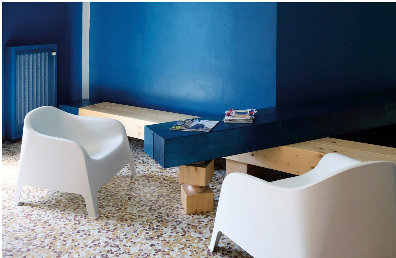
Figure 2. Cartoons corner: A co-designed and co-produced lounge for project Cantiere Mambretti.

The co-design process starts with a collective exploratory tour of the venue and is driven by a cycle of focus groups and design sessions with hosts and social and care operators in order to, first, understand the critical issues to be faced, and then to agree on solutions to be developed. Then, the group takes part in the making practices, i.e., furniture building, wall painting, setting up of wayfinding and signage systems (Figure 2). Cantiere Mambretti generates a sort of temporary "creative revolution" within the shelters in which all participants can have a voice and bring their help and competences (Campagnaro, Di Prima, & Ceraolo, 2018). The vibrant atmosphere of the workshop affects the reception service's routines, reverses roles, and creates a positive impact by giving value to participants' skills and aspirations. The effects of this designing together depend on the participants. As regards the experience of immigrants and the homeless, the participation generates their feeling of being active users and recognised