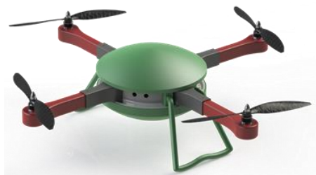
Fig.1. Graphical rendering of the UAV in S4A-C.

Fused Filament Fabrication (FFF) with standard polymers (such as PLA) and home-desktop devices. This work analyzes and discusses a preliminary simulation of the drone performances in four single-motor configurations (S) featuring 3, 4, 6, and 8 arms; those set-ups are labeled as follows: S3A-C, S4A-C, S6A-C, and S8A-C.