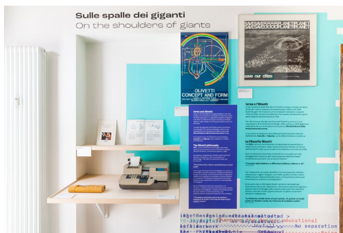
The room devoted to Olivetti's legacy of the exhibition Easy as a Kiss. Humanizing technology through design. Vision, story and impact of Interaction Design Institute Ivrea , curated by Jan-Christoph Zoels, Circolo del Design (Turin), 2021.

I came to interaction design from graphic design and typography. Designing a layout application in the 1980s, I realised that the everyday skills and knowledge of graphic designers could make software not only more beautiful but easier to use.