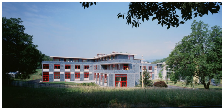
The Blue House, Interaction Design Institute, Ivrea.

The last people walked out of the IDII building in Ivrea in December 2005.