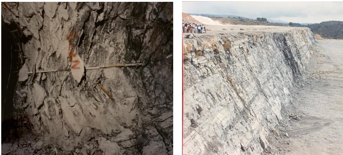
Figure 2. Left: Damaged wall at a crossing section between two temporary mine drifts in talc schist, at 450 m of depth: poor profile due to uncontrolled blasting and texture of the rock mass; half of a 2.5 m long rockbolt is in the plasticized/sheared zone of the pillar (Italy). Right: 18 m high bench in horizontally laminated limestone, careful blasting and scaling (Portugal).

In order to consider the rock mass conditions due to the inherent structure (i.e. geological damage), Paventi [12] proposed the use of the Inherent Rock Mass Damage Index ( D_i ), which is based on a rating system that involves four components (intact rock strength, meso-structure, joint conditions, macro-structure). Recently, Adoko and Zhael [13] proposed a methodology for assessing rock mass damage in underground mining by introducing the Rock Mass Damage index (RMDi), which is based on the methodology of the Rock Engineering System introduced by Hudson in 1992. The RMDi is based on the assessment of 9 parameters encompassing the quality of rock and the type of excavation technique, combined according a specific weighting that has been calibrated on a limited number of datasets. Jang et al. [14, 15] proposed an Overbreak Resistance Factor (ORF) examining the relationship between rock mass characteristics (unsupported face condition, uniaxial compressive strength, face weathering and alteration, discontinuities- frequency, condition and angle between discontinuities and tunnel contour) and the depth of overbreak through using feed-forward artificial neuron networks.