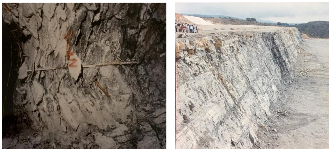
Figure 2. Left: Damaged wall at a crossing section between two temporary mine drifts in talc schist, at 450 m of depth: poor profile due to uncontrolled blasting and texture of the rock mass; half of a 2.5 m long rockbolt is in the plasticized/sheared zone of the pillar (Italy). Right: 18 m high bench in horizontally laminated limestone, careful blasting and scaling (Portugal).

In order to consider the rock mass conditions due to the inherent structure (i.e. geological damage), Paventi [12] proposed the use of the Inherent Rock Mass Damage Index ( D_i ), which is based on a rating system that involves four components (intact rock strength, meso-structure, joint conditions, macro-structure). Recently, Adoko and Zhael [13] proposed a methodology for assessing rock mass damage in underground mining by introducing the Rock Mass Damage index (RMDi), which is based on the methodology of the Rock Engineering System introduced by Hudson in 1992. The RMDi is based on the assessment of 9 parameters encompassing the quality of rock and the type of excavation technique, combined according a specific weighting that has been calibrated on a limited number of datasets. Jang et al. [14, 15] proposed an Overbreak Resistance Factor (ORF) examining the relationship between rock mass characteristics (unsupported face condition, uniaxial compressive strength, face weathering and alteration, discontinuities- frequency, condition and angle between discontinuities and tunnel contour) and the depth of overbreak through using feed-forward artificial neuron networks.