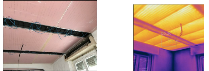
Fig. 1. Installation of the heating system (left) and thermography picture of the panels while working, by means of a thermoscanner (right)

A set of installations have been conducted to increase the energy and heating efficiency of the home while reducing waste. The first installation of the heating and conditioning system took place in the basements. The choice was a thermal system with energy generation based on a pellet stove. Then, for the rest of the house, radiant panels on the ceilings of the ground and first floor have been selected to allow the heating of three floors with just two series of panels. The panels have been applied to the false ceiling (Figure 1) to protect the load-bearing structures. The false ceiling leaves 5 mm of blank space to the ceiling, and it is 27 mm thick, supporting the 15 mm thick panels with a metal structure. The application of stucco and painting allowed the hiding of the panels to the residents' eyes. The chosen thermic plant is a reversible air-condensed heat pump, which can be used to both condition and heat the panels of the ground and first floors. Figure 1 depicts the panels heat generations.