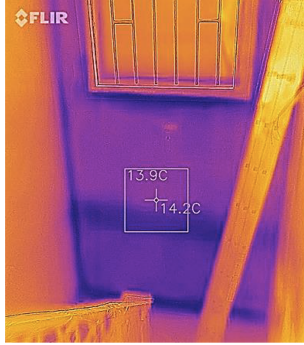
Fig. 2. Thermography of an external wall before the nanotechnology-based insulation.

between 0.040 and 0.050 W/mK . This value, associated with a thickness ranging between 4 and 5 mm, leads to a thermal resistance equal to 0.45 m^2K/W . A thermographic assessment of the walls showed that the average external wall temperature goes from 14°C before the treatment (Figure 2) to 18°C after the nanotechnology-based insulation (Figure 3).