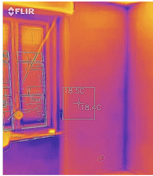
Fig. 3. Thermography of an external wall after the nanotechnology-based insulation.

During the house refurbishment, the wall radiators have been removed and a brand-new system has been created. The electric system switchboard that is supplied by the photovoltaic modules is connected with all the household plugs and appliances and the heat pump. The reversible heat pump generates the domestic hot water (DHW) used both in household utilities and in panel heating.