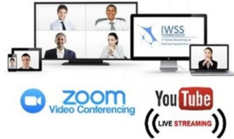
Figure 1: Header of the IWSS 2020 Homepage (top). Pavillon-C Exhibition Center in Turin by Riccardo Morandi, 1950 (bottom left); the Sabaudian city in northern Italy was the chosen conference site before COVID-19 outbreak. On-line platforms for IWSS2020 direct broadcast in June 2020 (bottom right)

structures. These may also include tension elements and membranes, framed and lattice structures, grid-shells and active-bending structures, shell roofs, tensegrity structures, pneumatic and inflatable structures, active and deployable structures, concrete, metal, masonry, timber and bio-inspired structures.