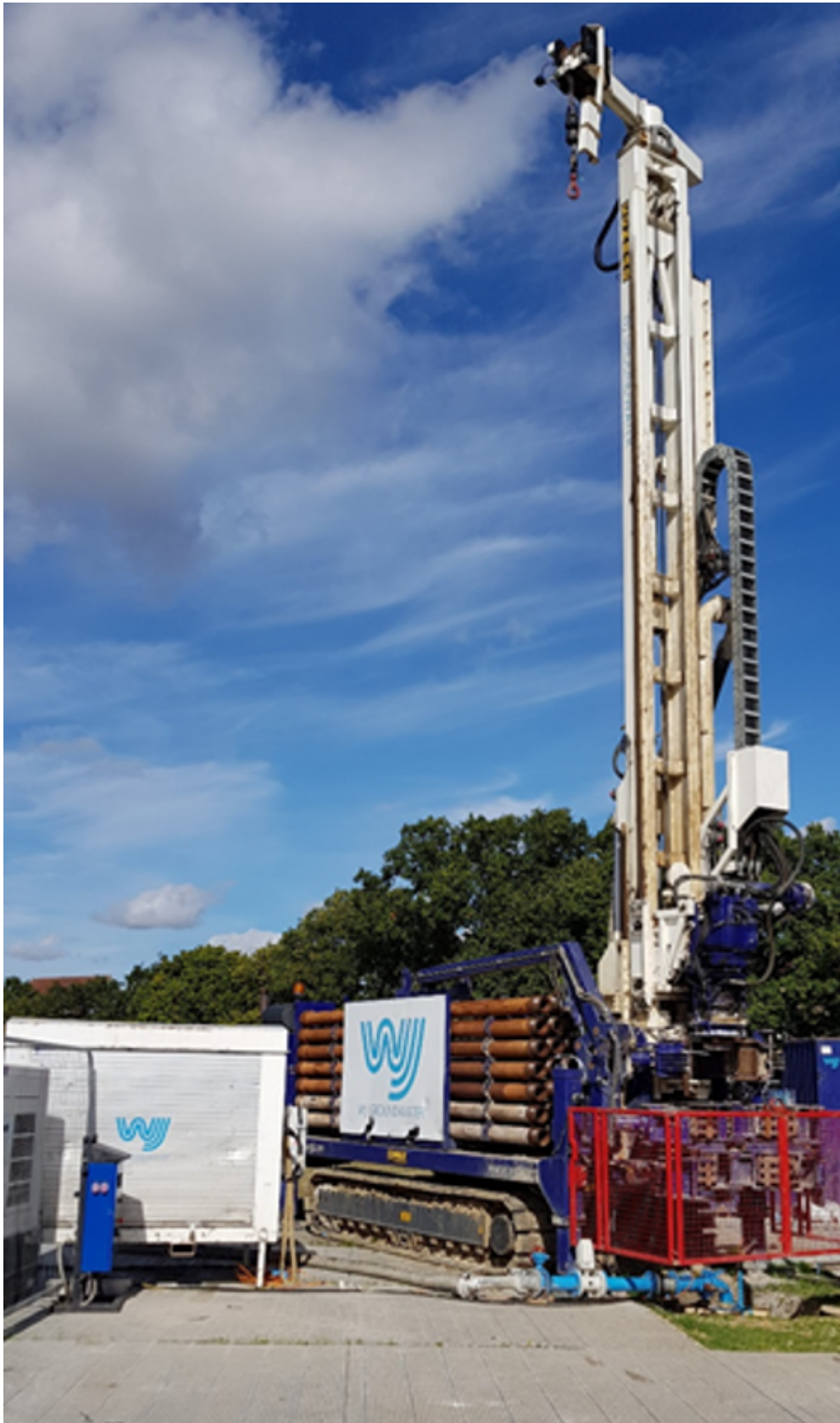
Figure 3. Borehole drilling at Northern Gateway site in Colchester, UK (WJ UK, 2021).