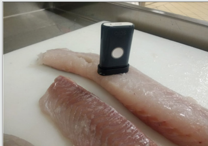
Figure 1: The SCiO(Consumer Physics, Israel) pocket infrared scanner.