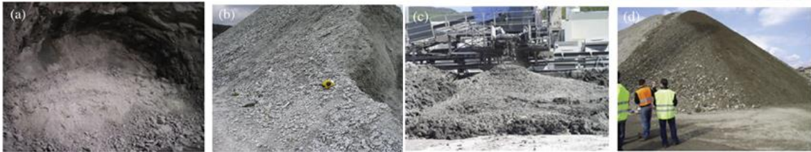
Figure 1. Four types of muck suitable for reuse: a) after Drill and Blast in granitic rock mass; b) dump of granitic chips after full face TBM excavation in granitic rock mass; c) EPBS machine excavation in hard soil – soft rock formation, with conditioning; d) dump of coarse soils after mechanized excavation in alluvium.

for the reuse, the higher the quality required, and the stricter the characterisation campaign needs to be. Typical tests relate to the assessment of physical state (size, shape, specific gravity, roughness, void ratio, porosity) and mechanical properties (compressive strength and resistance to impact, fragmentation and crushing), as well as durability features (resistance to polishing, abrasion and wear, chemical composition and presence of hazardous substances, volumetric stability, water absorption and solubility, durability to frost and alkali-aggregate reaction for concrete preparation).