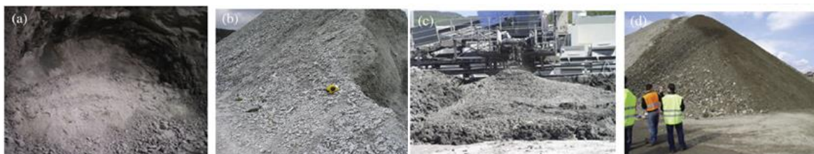
Figure 1. Four types of muck suitable for reuse: a) after Drill and Blast in granitic rock mass; b) dump of granitic chips after full face TBM excavation in granitic rock mass; c) EPBS machine excavation in hard soil – soft rock formation, with conditioning; d) dump of coarse soils after mechanized excavation in alluvium.

for the reuse, the higher the quality required, and the stricter the characterisation campaign needs to be. Typical tests relate to the assessment of physical state (size, shape, specific gravity, roughness, void ratio, porosity) and mechanical properties (compressive strength and resistance to impact, fragmentation and crushing), as well as durability features (resistance to polishing, abrasion and wear, chemical composition and presence of hazardous substances, volumetric stability, water absorption and solubility, durability to frost and alkali-aggregate reaction for concrete preparation).