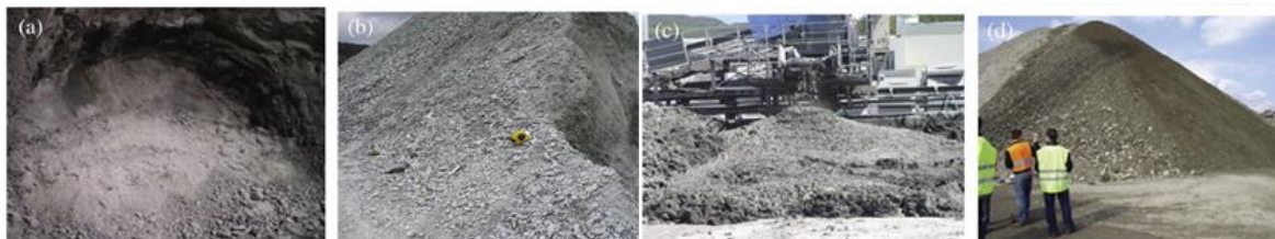
Figure 1. Four types of muck suitable for reuse: a) after Drill and Blast in granitic rock mass; b) dump of granitic chips after full face TBM excavation in granitic rock mass; c) EPBS machine excavation in hard soil – soft rock formation, with conditioning; d) dump of coarse soils after mechanized excavation in alluvium.

for the reuse, the higher the quality required, and the stricter the characterisation campaign needs to be. Typical tests relate to the assessment of physical state (size, shape, specific gravity, roughness, void ratio, porosity) and mechanical properties (compressive strength and resistance to impact, fragmentation and crushing), as well as durability features (resistance to polishing, abrasion and wear, chemical composition and presence of hazardous substances, volumetric stability, water absorption and solubility, durability to frost and alkali-aggregate reaction for concrete preparation).