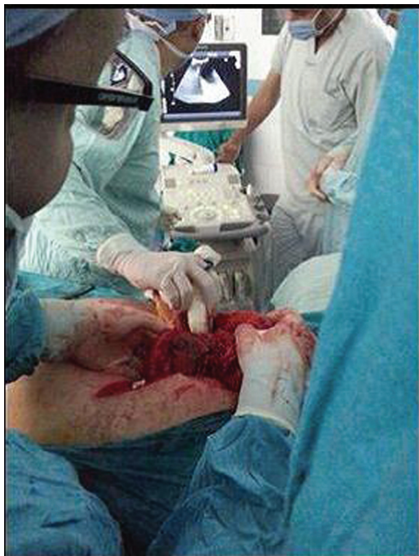
Placement of the intraoperative ultrasound probe.