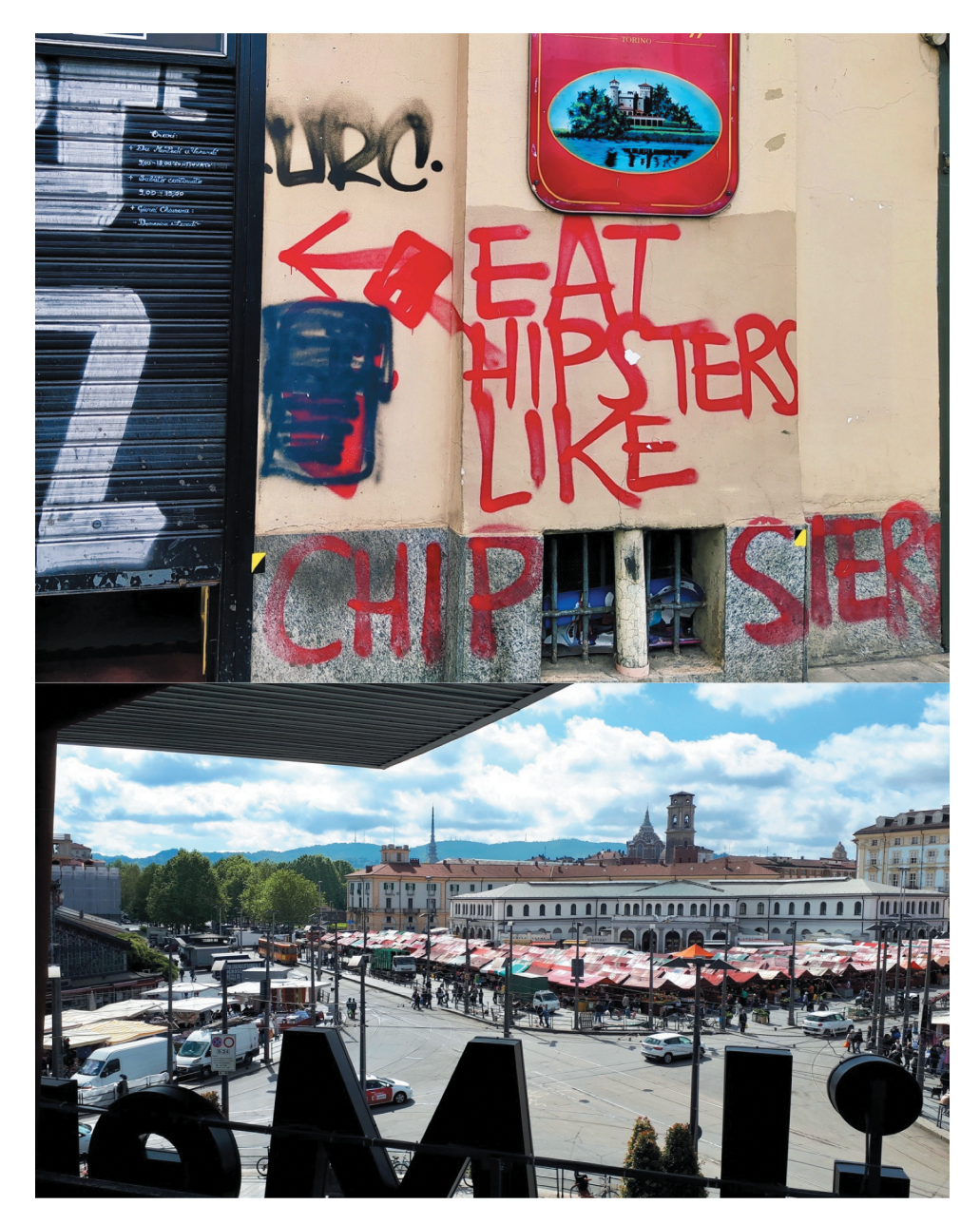
Figure 1. Above: "EAT HIPSTERS LIKE CHIPSTERS (an Italian chips' brand)". Writing on a wall of Porta Palazzo. Below: Partial view of the marketplace from the terrace of Mercato Centrale.

citizens to demonstrate against what is perceived as the ongoing gentrification of Porta Palazzo and northern Turin in general. To them, it marks symbolically and materially the direction and essence of Turin's gentrification: where to the process will proceed next (i.e. the north), and how (i.e. through food). A public discourse about food's gentrifying effects has been present before the brand's arrival. A theatrical project entitled Foodification: How food ate the city , a sarcastic story of food and urban transformations,