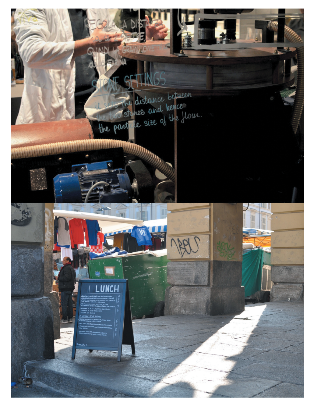
Figure 3. Above: "Grinding together the cereals" demonstration at Mercato Centrale. Below: "The LUNCH". The menu of a new eatery on Porta Palazzo.

the consumption of a distinct ethnic food. The construction of "Italianness" and the displacement of Barattolo's, predominantly non-Italian, vendours, manifest an environmental racism that penetrates food and its spatialities (Anguelovski, 2015; Slocum, 2007), and that might significantly contribute to the displacement atmosphere for consumers of color or/and foreign origins.