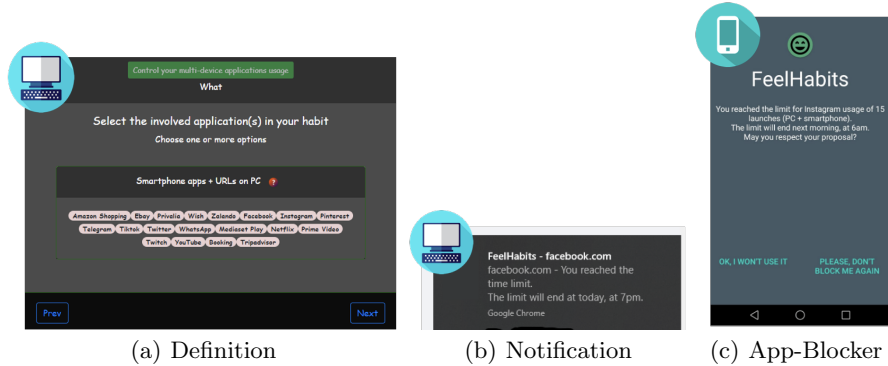
Fig. 1. FeelHabits is a multi-device DSCT targeting PCs and smartphones. Through a dedicated Google Chrome extension (a), the user can define an intention , i.e., a temporal and/or launch limit, for her different devices. When intentions are not respected, FeelHabits can send notifications on the device that is currently in use (b), or it can block the access to specific websites or apps (c).

In an initial implementation of FeelHabits , composed of a mobile app and a Google Chrome extension, a user can define these intentions by targeting her PC and her smartphone (Figure 1(a)). Intentions can be defined for the overall multi-device usage of the user ( device-level intentions), or they can be restricted to the usage of specific services available both on the PC and on the smartphone ( app-level intentions), e.g., a social network that can be accessed through the browser and a dedicated mobile app. Furthermore, intentions can be linked to specific temporal contexts, e.g., the time of the day. FeelHabits then monitors the multi-device usage of the user, and it can use different level of severity when intentions are not respected, from simple notifications alerting the user of a reached limit on a given device (Figure 1(b)) to app-blockers (Figure 1(c)).