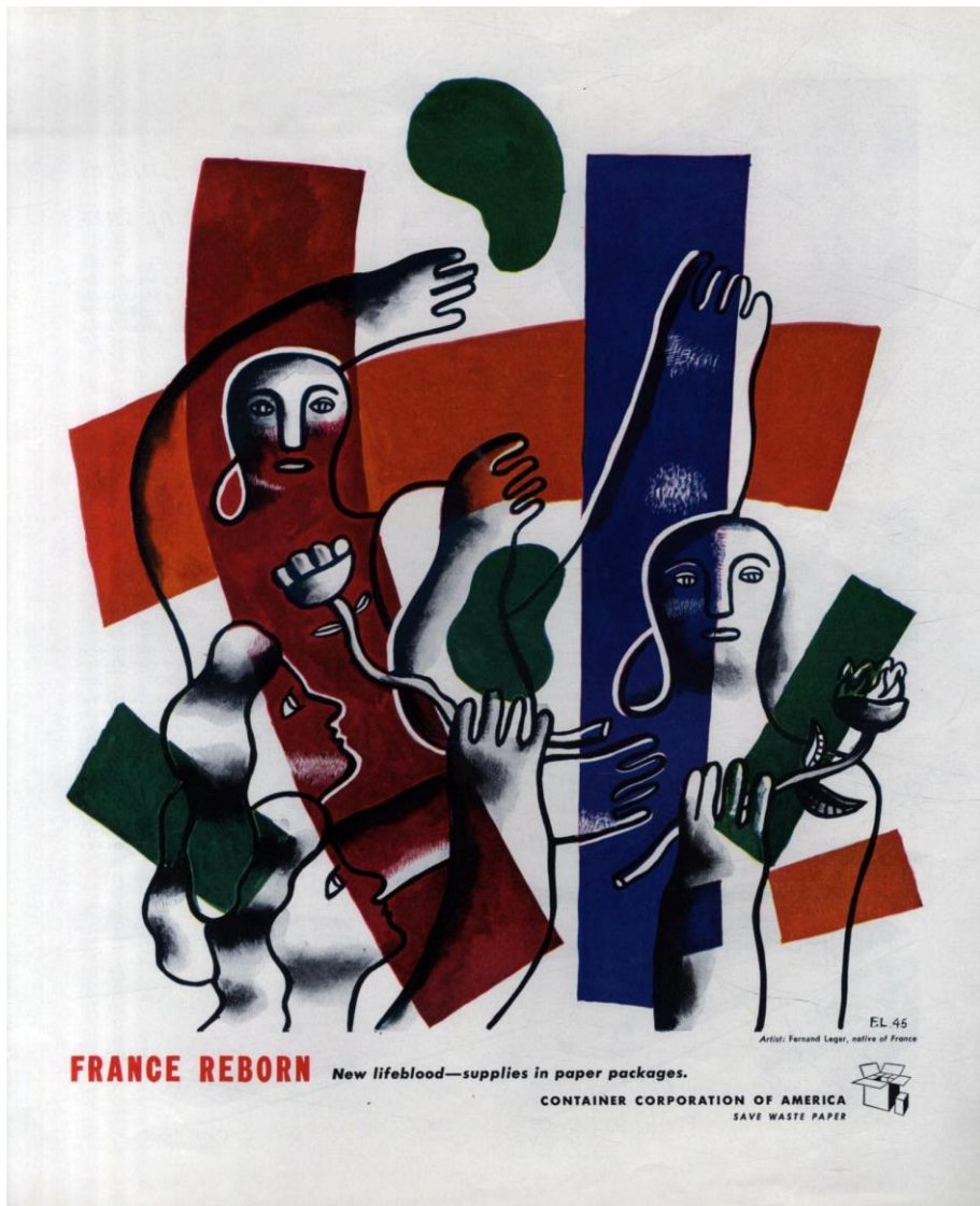
Figure 1. Magazine page designed by Fernand Léger for Walter Paepcke's Container Corporation of America. For Paepcke, visual arts and graphic design were crucial tools for improving business well before the inception of the IDCA.

suggest that the presence of industrialists was not that essential for the real objectives of the IDCA.