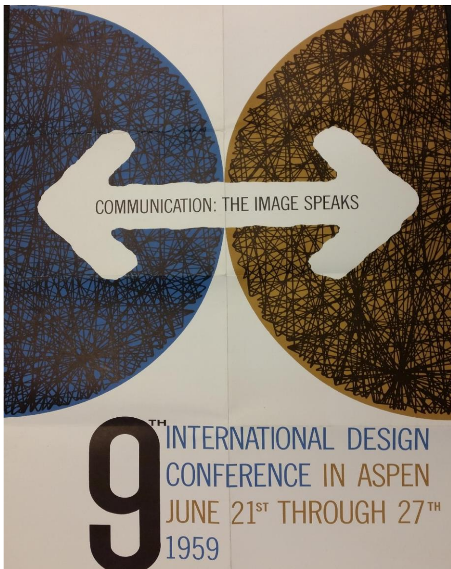
Figure 3. Poster of the IDCA 1959.

designers to take responsibility, that is, to be members of mankind and to fully understand what their “membership” meant: (...) what has been lost is the fact and the ethos of man as craftsman” (IDCA Records, 1958). Man and ethics were the new issues at the top of the design agenda; a similar mindset was spreading also on the other side of the ocean, where the debate started focusing more and more upon design’s moral and political values, including in teaching (Stile Industria, 1959).