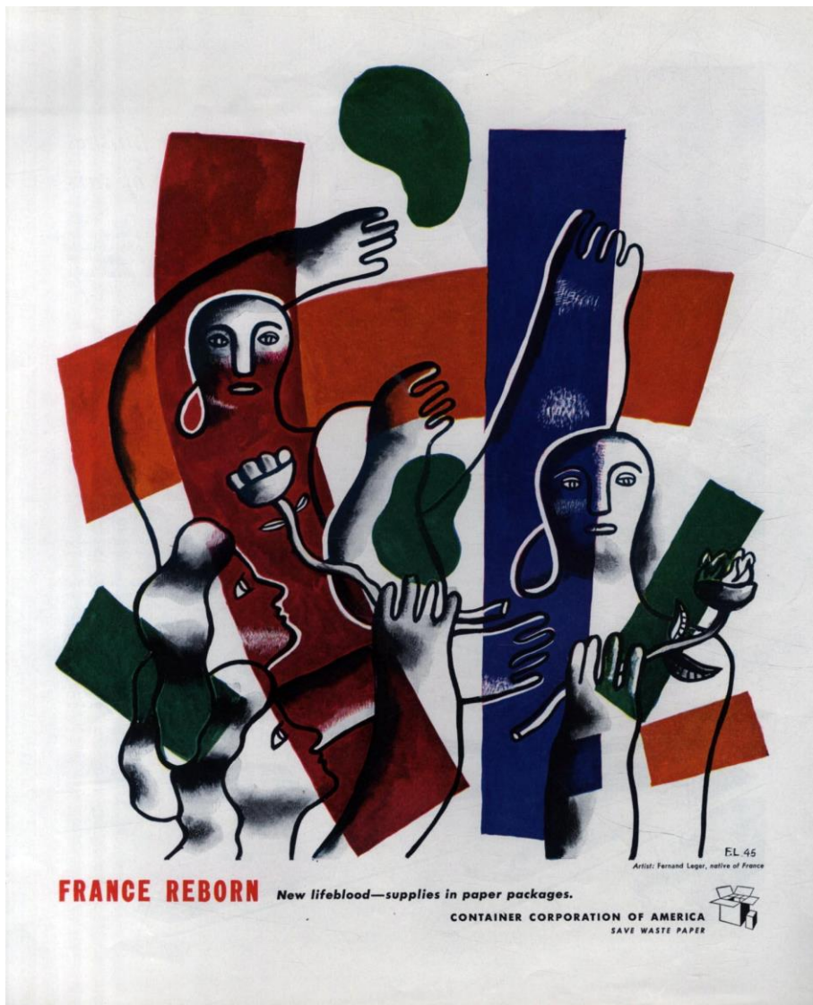
Figure 1. Magazine page designed by Fernand Léger for Walter Paepcke's Container Corporation of America. For Paepcke, visual arts and graphic design were crucial tools for improving business well before the inception of the IDCA.

suggest that the presence of industrialists was not that essential for the real objectives of the IDCA.