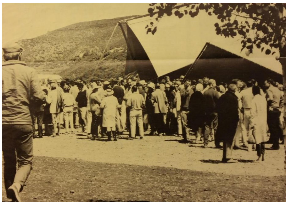
Figure 4. IDCA 1965 attendees gathered in front of the new tent designed by Herbert Bayer, replacing the former by Eero Saarinen.

Already in 1964, however, critique made its way back into the IDCA. The premise of the conference - titled Directions and Dilemmas by the chairman Eliot Noyes – was once again the need for an “enlightened materialism”, able to improve the conditions in which human beings live. Particularly interesting, in that context, was the case made by the New York-based writer Ralph Caplan for the development of a more rigorous form of design criticism: “if the nation is to have public awareness of design, we need popular design critics and reviewers. (...)”, people whose voice would help to stop “the flood of superfluous appliances” (IDCA Records, 1964).