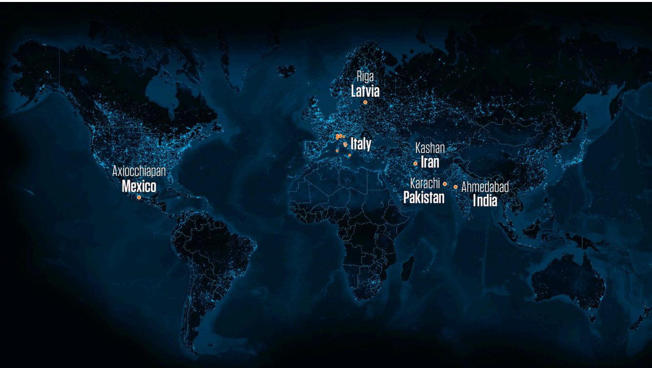
Fig.I Geographic coverage of this publication - global level (created by Maria Diez, Fundacion Metropoli)