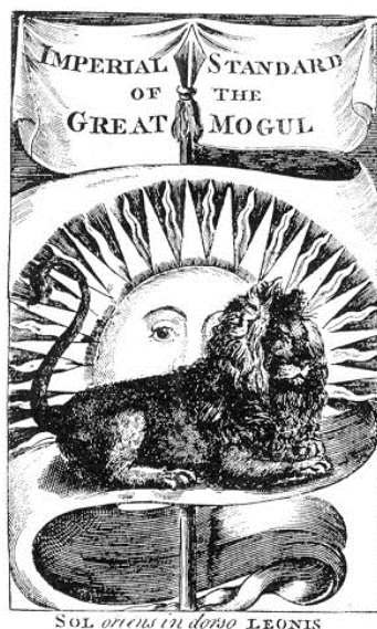
Figure 6: An engraving from Edward Terry's A Voyage to East-India (1655) titled Imperial Standard of the Great Mogul .

The Mughal Empire had a number of imperial flags and standards. The principal imperial standard of the Mughals displayed a lion and sun. The Mughals traced their use of this flag back to Timur [19]. About the historical Persian flags, it can help us the Encyclopaedia Iranica website [20]. Both the Sun and Golden Lion are symbols of kingship and royalty.