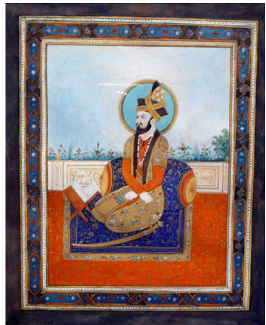
Figure 2: Portrait of Humayun. Note the aura, the divine effulgence, surrounding the head of the emperor

As a consequence, we have that Akbar was "His Majesty the Sun", "The Sun of Mighty Power", "Lamp of the Court of Dominion of Taimur's Dynasty", "Visible God". And the favored wife of Jahangir was "Nur-e-Jahan", which means "The Light of the World". Mumtaz Mahal, the beloved spouse of Shah Jahan, was "The Sun of Modesty" and the Princess Jahanara "The Light of the Imperial Chamber" [12].