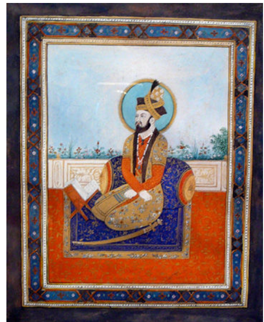
Figure 2: Portrait of Humayun. Note the aura, the divine effulgence, surrounding the head of the emperor

As a consequence, we have that Akbar was "His Majesty the Sun", "The Sun of Mighty Power", "Lamp of the Court of Dominion of Taimur's Dynasty", "Visible God". And the favored wife of Jahangir was "Nur-e-Jahan", which means "The Light of the World". Mumtaz Mahal, the beloved spouse of Shah Jahan, was "The Sun of Modesty" and the Princess Jahanara "The Light of the Imperial Chamber" [12].