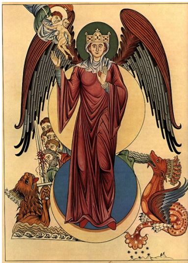
Figure 5: The woman of Apocalypse. Note the crescent moon.

The sun and the crescent moon together could seem an iconography which is far from the European arts. However, we have them too. In the Figure 5, we can see the woman of the Apocalypse in an illustration of the Hortus deliciarum (c.1180). Another interesting example is Our Lady of Victory (1654), a statue which is showing a crescent moon and solar rays, on the portal of Schlögl monastery church.