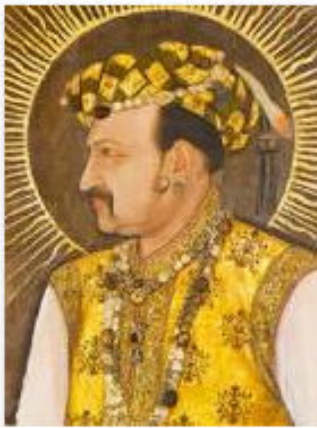
Figure 1: Nur-ud-din Mohammad Salim, known by his imperial name Jahangir "conqueror of the world", was the fourth Mughal Emperor. Note the aura radiating from his head.

From the Hindu tradition were derived the practices of the Mughal sun worship, which included the ceremony of the darshan, when the emperors appeared in the jharokha [13] at the moment of the sunrise [12]. Another source of the Mughal solar symbolism was an ancient Persian concept of the divine glory. Abul Fazl, vizier and chronicler of Akbar's reign, tells: "Kingship is a light emanating from God, a ray from the sun, the illuminator of the universe, it is the argument of the book of perfection, the receptacle of all virtues". The divine light was visible as an "aura" radiating from "the blessed face of the ruler"; this aura was represented as haloes encircling heads of the monarchs in the Mughal art [12] (see examples Figures 1-3). On the halo surrounding the head of emperors see also [14].