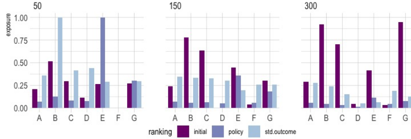
(a) Barplot of aggregate exposure for the top-50, top-150 and top-300, initial score ranking, standardized ranking and \Gamma ranking.