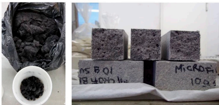
Figure 3. ReCash Plaster (Recycled Cashmere for Plaster): from textile waste to experimental specimens. On the left, wool and cashmere dust; on the right, pre-mixed plaster obtained by replacing glass fibres with textile waste.

waste. The first scenario involves the plaster manufacturer, which would have to invest in a machine for the industrialised dispersion of the fibres in the mixture, which was carried out manually during the experimental phase. The second scenario involves the addition of an element to the supply chain between the company supplying the waste and the company producing the plasters: a third company capable of taking the waste and processing it for subsequent economic exploitation as a new resource. Each of these scenarios presents strengths and weaknesses that deserve to be discussed during the industrial development phase, but each scenario is formulated to foresee economic advantages for the parties involved. In an upcycling concept, some pre-consumption textile waste can be transformed from waste into a resource and included in a new “value chain” [20].