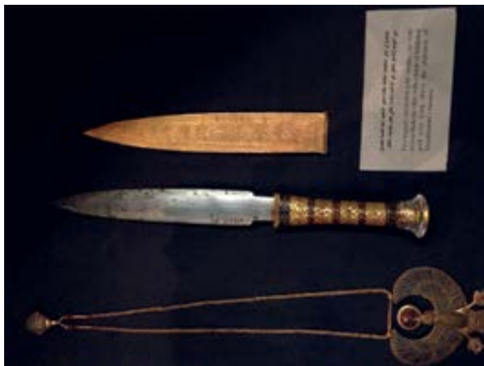
Fig. 3. Tutankhamun's iron dagger blade and sheath. Cairo Egyptian Museum.

We now know, with a very high degree of confidence, that Tutankhamun's iron dagger blade was made of meteoritic iron. It appears that ancient Egyptians were well aware of iron falling from the sky. Quoting from George Frederik Zimmer, The Antiquity of Iron (1915): "The most ancient name for iron was 'Metal from Heaven'. In the hieroglyphic language, it was pronounced BA-EN-PET, meaning either stone or metal from Heaven. A basic Egyptian idea, expressed in ancient Egyptian texts, was that the firmament of Heaven was made of iron. This belief probably arose from iron's blue color and from the occasional fall of meteoritic iron from the sky". But the importance of iron in ancient Egypt was not only limited to references in religious texts. Referring again to Zimmer (1915), one of the Pharaoh's of the I Dynasty was known by the name MER-BA-PEN, literally, Lover of this iron . A Pharaoh would not bear that name if the Egyptians of the I Dynasty had not known iron.