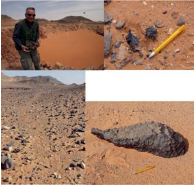
Fig. 6. Images from the Gebel Kamil impact craters, with meteorite fragment resting on Paleolithic paths (bottom left).