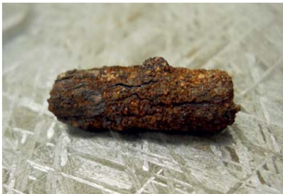
Fig. 1. Prehistoric iron bead excavated at the Gerzeh cemetery made from meteorite iron, The Manchester Museum.