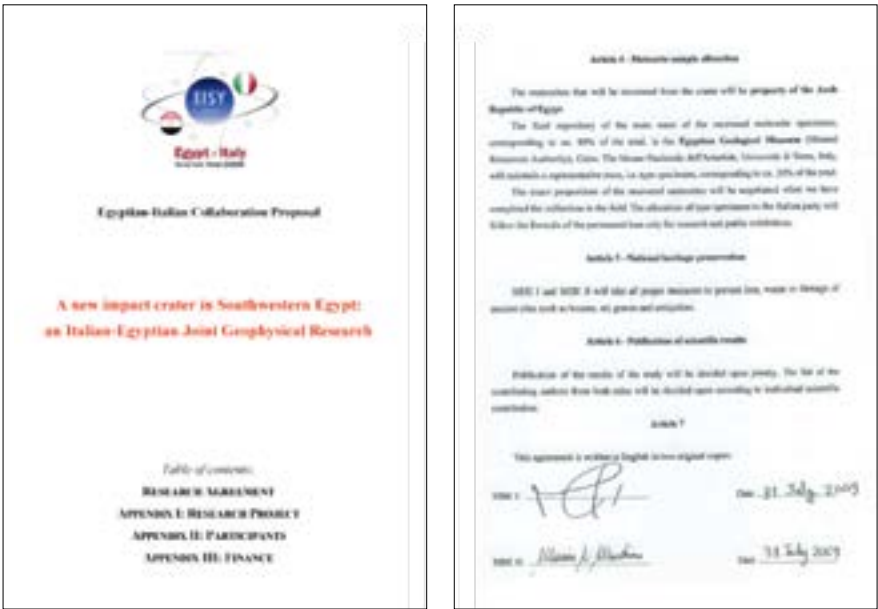
Fig. 5. Cover and signed page of the bilateral Egyptian-Italian Agreement that allowed setting up a joint expedition to the Gebel Kamil crater impact site.