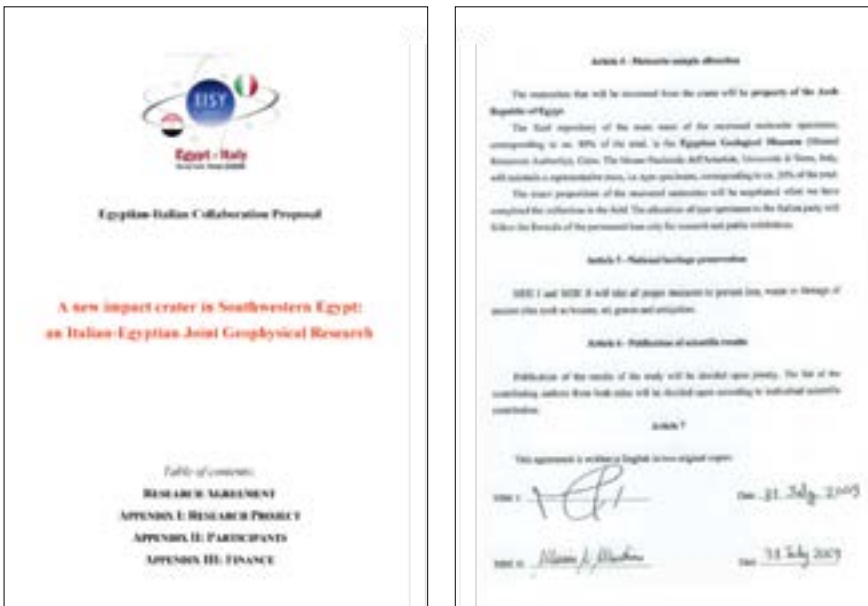
Fig. 5. Cover and signed page of the bilateral Egyptian-Italian Agreement that allowed setting up a joint expedition to the Gebel Kamil crater impact site.