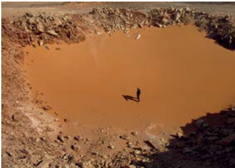
Fig. 7. Gebel Kamil impact crater visited by the author in 2012.