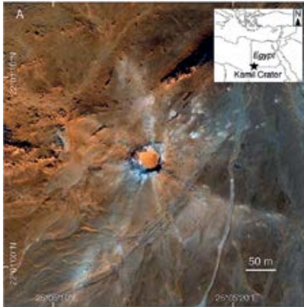
Fig. 4. Gebel Kamil meteorite impact crater as first observed by Vincenzo De Michele on Google Earth.