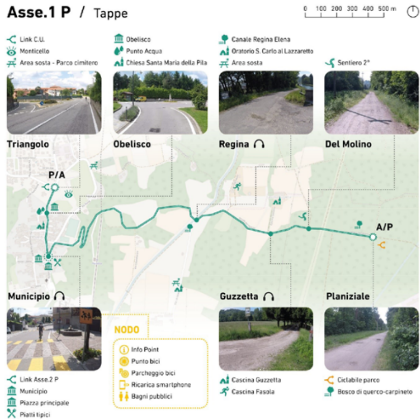
02 Cycle route in the municipality of Pombia, there are the stages with points of interest and services for cyclists