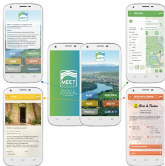
03 Designed interfaces for the MEET Ticino App where the different sections are visible: MAB, Tours, Routes and Stops