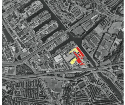
Figure 4. Industrial settlements as landmarks (author 2020)