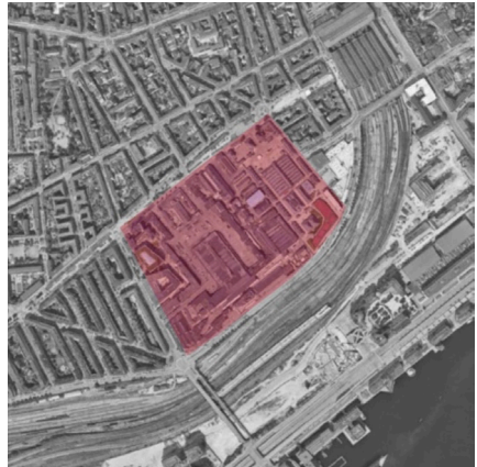
Figure 3. Industrial settlements as a city in the city (author 2020)