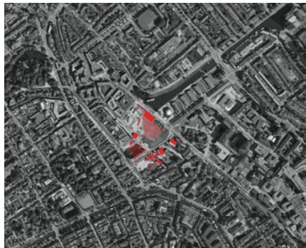
Figure 6. Industrial settlements as rift (author 2020)

suggests to read them as layered structured where traces from the past have been erased but still recognizable here and there by emerging fragments. To recognize the meaning of those emerging elements they have to be read as a part of a same layer. The palimpsest metaphor allows to consider the urban fabric as a parchment sheet full of inscriptions and traces left behind by society and construction not always taken into consideration when a new layer, like the productive layer, is added to the city. Therefore, following specific functional and logistical needs, sometimes industries are built up without any consideration to the previous rural or urban traces. The result is that the layout of the built elements as well as their pattern and their boundaries cut the city without any consideration for the existing urban pattern or connections. This is the case of the Ebbinge industrial suburb of Groningen in the Netherlands (fig. 6), where the industrial development of the early XX century consists in a series of productive pavilions built regardless to the previous urban pattern or to the surrounding plots. The regeneration operation called open Lab Ebbinge, assumed the rationale of the industrial original settlements, and promote a temporary settlement made of contemporary pavilions deliberately in contrast with the surrounding urban fabric, belonging to the pavilion layer of the historical factories.