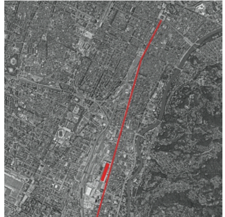
Figure 2. Industrial settlements as new expansion directions' drivers (author 2020)

suburbs of Paris by Bernard Tschumi is completely based on a layer's rationale which is able to organize the people fluxes, as it is now a scientific public park, but also to keep memory of the industrial past traces.