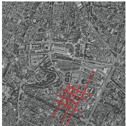
Figure 1. Industrial settlements as a pattern matrix (author 2020)

between private and public space. Building a sequence of historical buildings survey of the settlements, Muratori's analysis reveals the "hidden structure" of urban phenomena, the morphogenesis process. Applied to the Michelin Area (fig. 1) developed in the second part of the XIX century in the northern part of Torino (Italy), this type of analysis unveils the original connection between the contemporary urban fabric and the pattern enclosure inside the dismantled factories' wall. The other school related to morphological approach, the Conzenian approach (Conzen 1960), can usefully complete the Muratori' s analysis. Actually Conzen focus more on the arrangement of street and plots and therefore allows to understand how the industrial needs, in term of movement and circulation, engender the urban pattern of street and how the plot's characteristics of the industry is able to deal and/or to influence residential surrounding patterns. The regeneration of the industrial Docks on the riverside of Marseille well illustrates urban design centered on the reconversion of the industrial pattern driven by the conzenian approach.