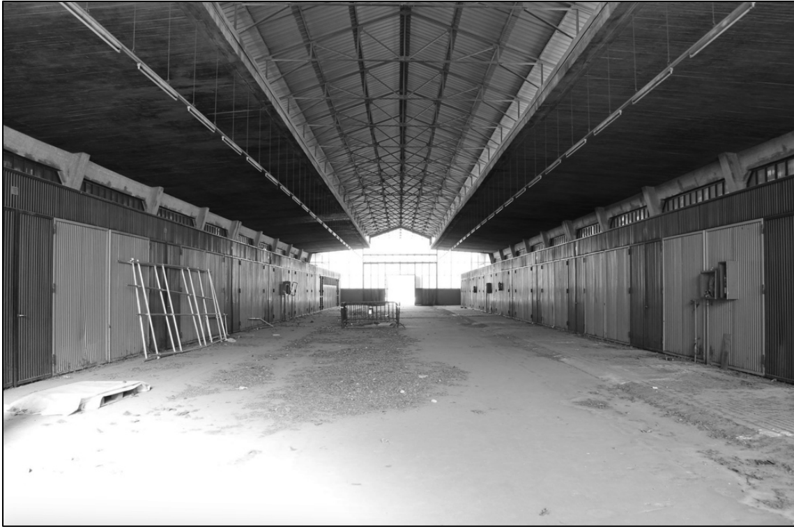
Fig. 5 Mercado de Legazpi in 2015. First floor with subsequent additions due to various changes of function.

access area to the market area. At the center of the large inner square was a small structure in which the services were located, isolated from the storage and sales areas for hygienic reasons and the width of the space was designed for vehicular traffic. The internal space of the Mercado is marked by rows of concrete pillars that form six bays whose outer space housed the rail. The repetitiveness of the obstacle-free construction system gives a solemn view of the environment. On the first floor, the lack of two rows of pillars gives way to a central corridor, a passage for the means of transport for goods that entered the building directly from the Puente de la Princesa . The structure of the building allowed three different flows: pedestrian, road and rail.