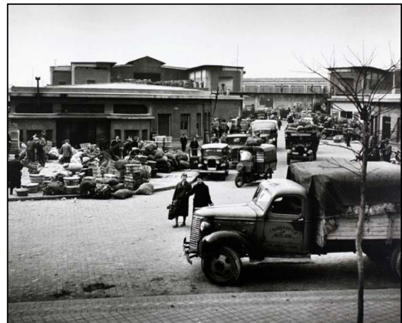
Fig. 3 Entrance of the Mercado from the Plaza Legazpi in 1960 at the height of its activity.