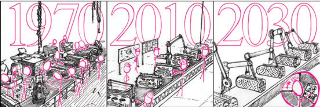
03. All normalities are unexpected/3. Carlo Deregibus, 2020, propriety of the author.