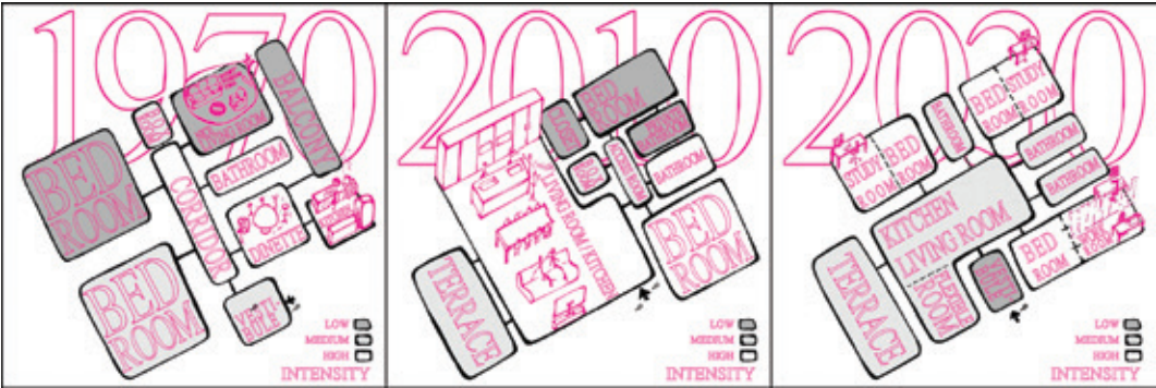
02. All normalities are unexpected/2. Carlo Deregibus, 2020, propriety of the author.