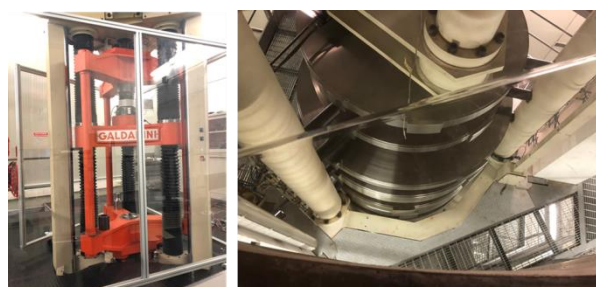
Figure 1: The 1 MN deadweight force standard machine

anchored to the load-bearing structure arranged at 120^\circ on a diameter of about 6 m (Figure 1).