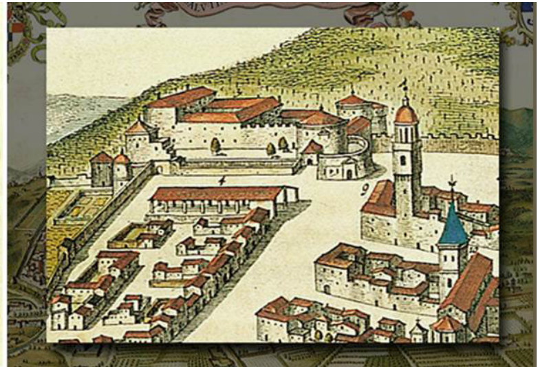
Fig. 9: Salutarum - Civitas vulgo Saluzzo , view on the left and detail on the right in Theatrum Sabaudiae , 1725 (1682, first edition).