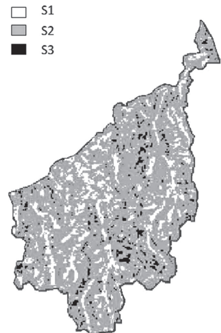
Fig. 3. Map of susceptibility to shallow landslides for the Cellio Municipality (VC). Classes of susceptibility: very low (S1), low/moderate (S2) and high (S3)

Using the ArcGIS software a susceptibility map was constructed, having identified three classes of susceptibility: S1, very low; S2, low/moderate (i.e. there are no evidences that the area is prone to landslide, but there are some unfavourable factors that make the triggering of a landslide conceivable); S3, high. The susceptibility map obtained is shown in Figure 3.