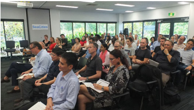
SeaCities Symposium, 2 March 2020, Griffith University

We believe the SeaCities initiative provides an excellent platform for urban experiments designed in response to the challenges associated with sea-level rise. As part of the Cities Research Institute, one of the largest groups of urban researchers in Australia, and in partnership with a network of researchers from around the world, including at Columbia and Delft University and with industry