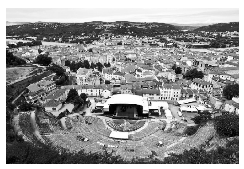
Traces of the Roman theatre of Massilia ruins. Colonia Julia Viennensis: Roman theatre.