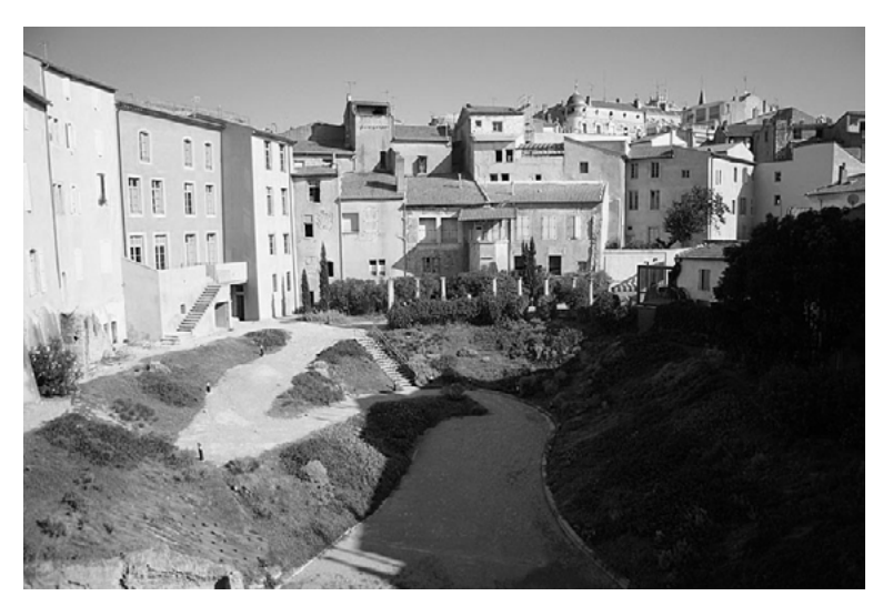
Forum Julii theatre and Baeterrae amphitheatre.