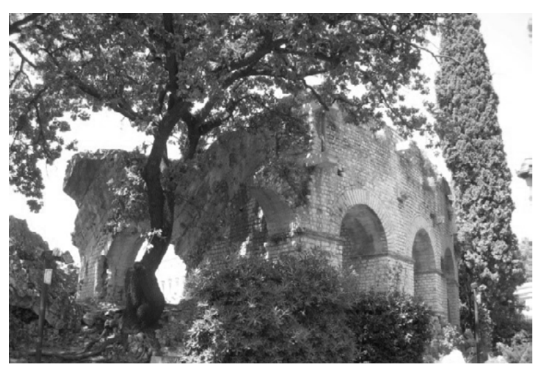
The Lutèce Arena, Paris. Cimiez archaeological site and part of the amphitheatre of Cemelenum.