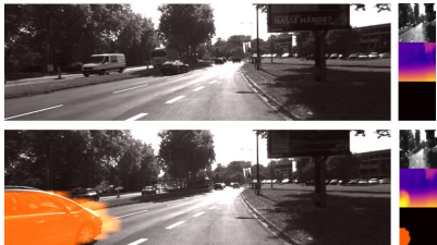
Figure 3. Simple traffic monitoring application. At the right-most position of each frame, we show, from top to bottom, the input 32 \times 32 input image, the depth map inferred by our network from it, and the output of a simple detection system working in the depth domain.

compact, with a footprint of about 100kB ( i.e. , about 100k weights, quantized to 8bit) and trained in a self-supervised manner in order to enable meaningful depth prediction, as reported in Figure 1, at about 2 FPS on the popular ARM M7 architecture ( e.g. , the OpenMV CAM M7 in Figure 2).