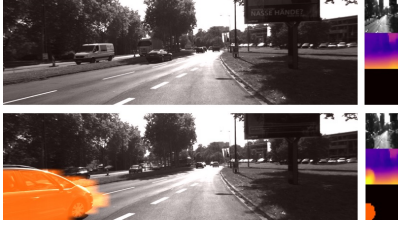
Figure 3. Simple traffic monitoring application. At the right-most position of each frame, we show, from top to bottom, the input 32 \times 32 input image, the depth map inferred by our network from it, and the output of a simple detection system working in the depth domain.

compact, with a footprint of about 100kB ( i.e. , about 100k weights, quantized to 8bit) and trained in a self-supervised manner in order to enable meaningful depth prediction, as reported in Figure 1, at about 2 FPS on the popular ARM M7 architecture ( e.g. , the OpenMV CAM M7 in Figure 2).