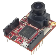
Figure 2. Deployment platform for the proposed solution. On a microcontroller platform (OpenMV Cam M7), we deploy a compact architecture made of about 100k parameters.

rate monocular depth perception system compatible with the constrained computing architectures found at the very edge. By processing low-resolution images ( e.g. , 48 \times 48 ), we can infer depth maps as shown in Figure 1 on a sub-W power envelope with the accuracy reported in Table 1.