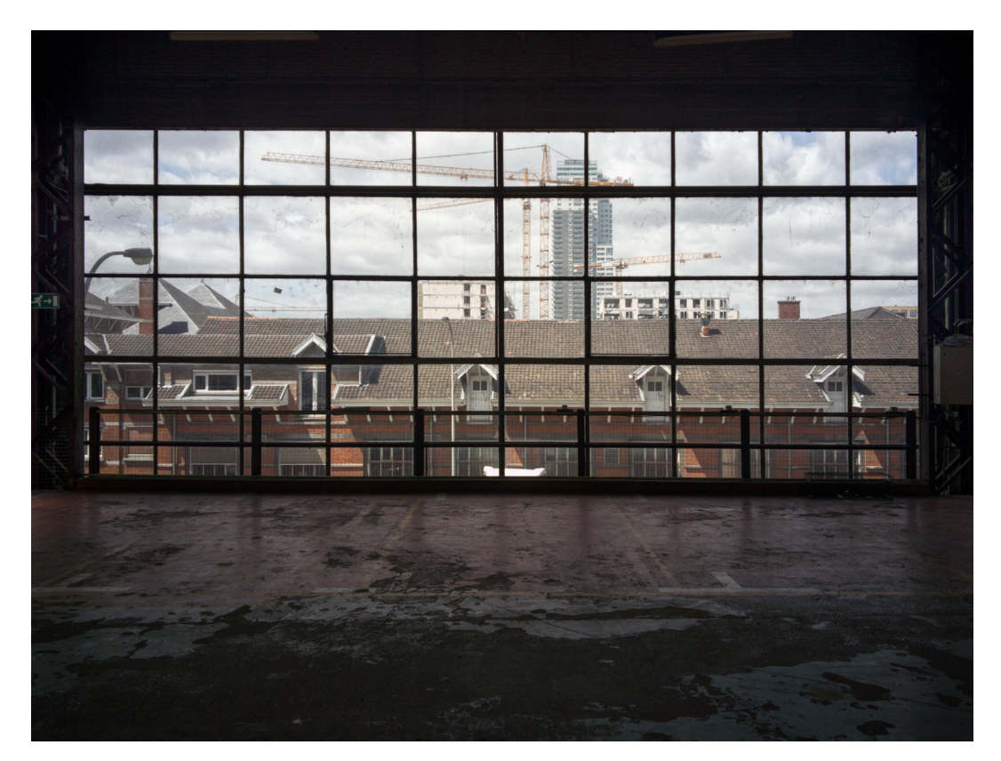
The view from the factory. KANAL/Centre Pompidou. Former Citroën Factory. Bruxelles 2018